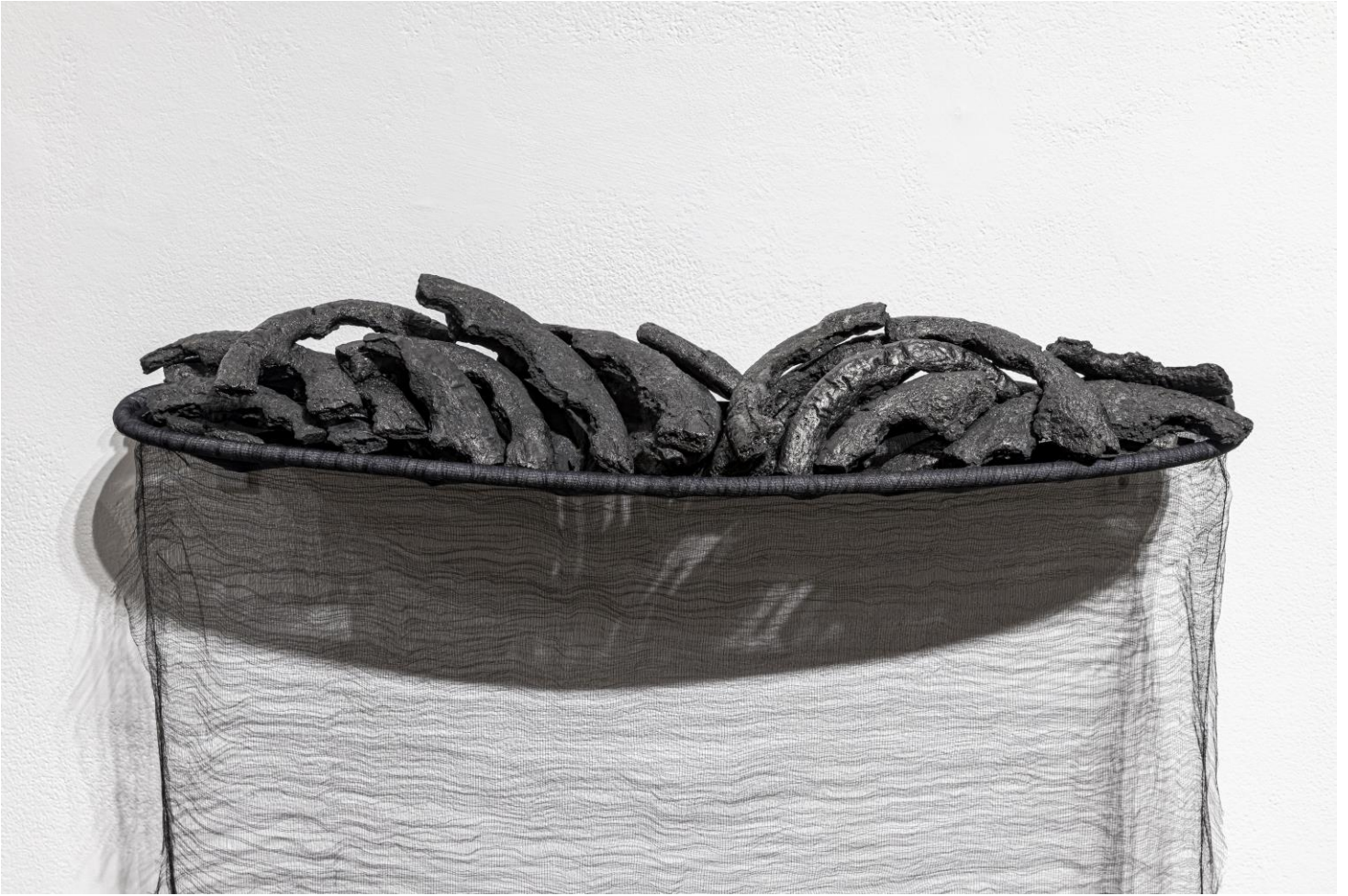
Beth Stuart detail of Delible (wheat) , 2024