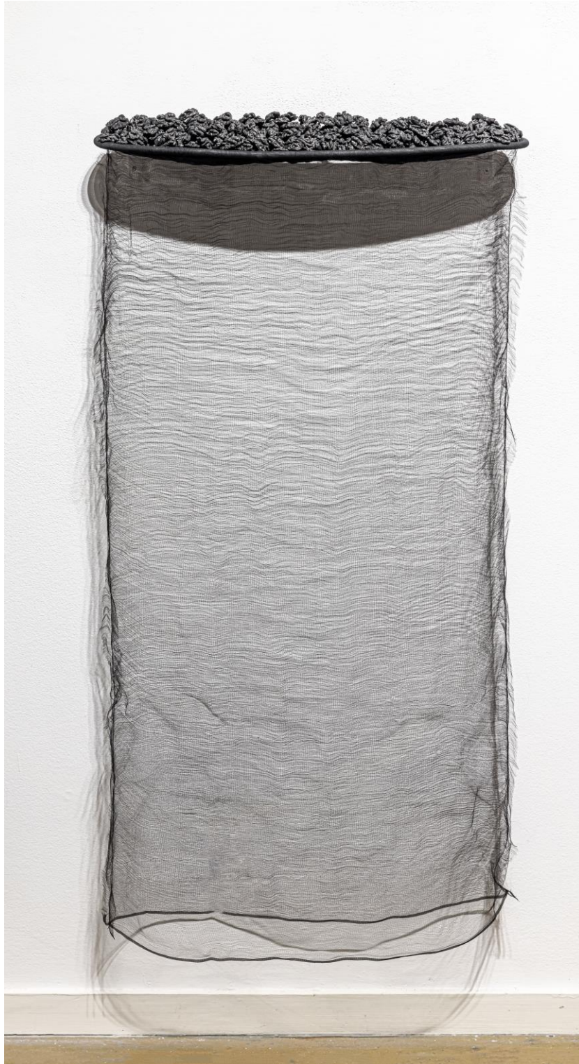
Beth Stuart Delible (walnut) , 2024 plaster, iron oxide pigment, dyed silk, steel, sumi ink 48 1/8 x 24 x 3 7/8 in. (117 x 61 x 10 cm)