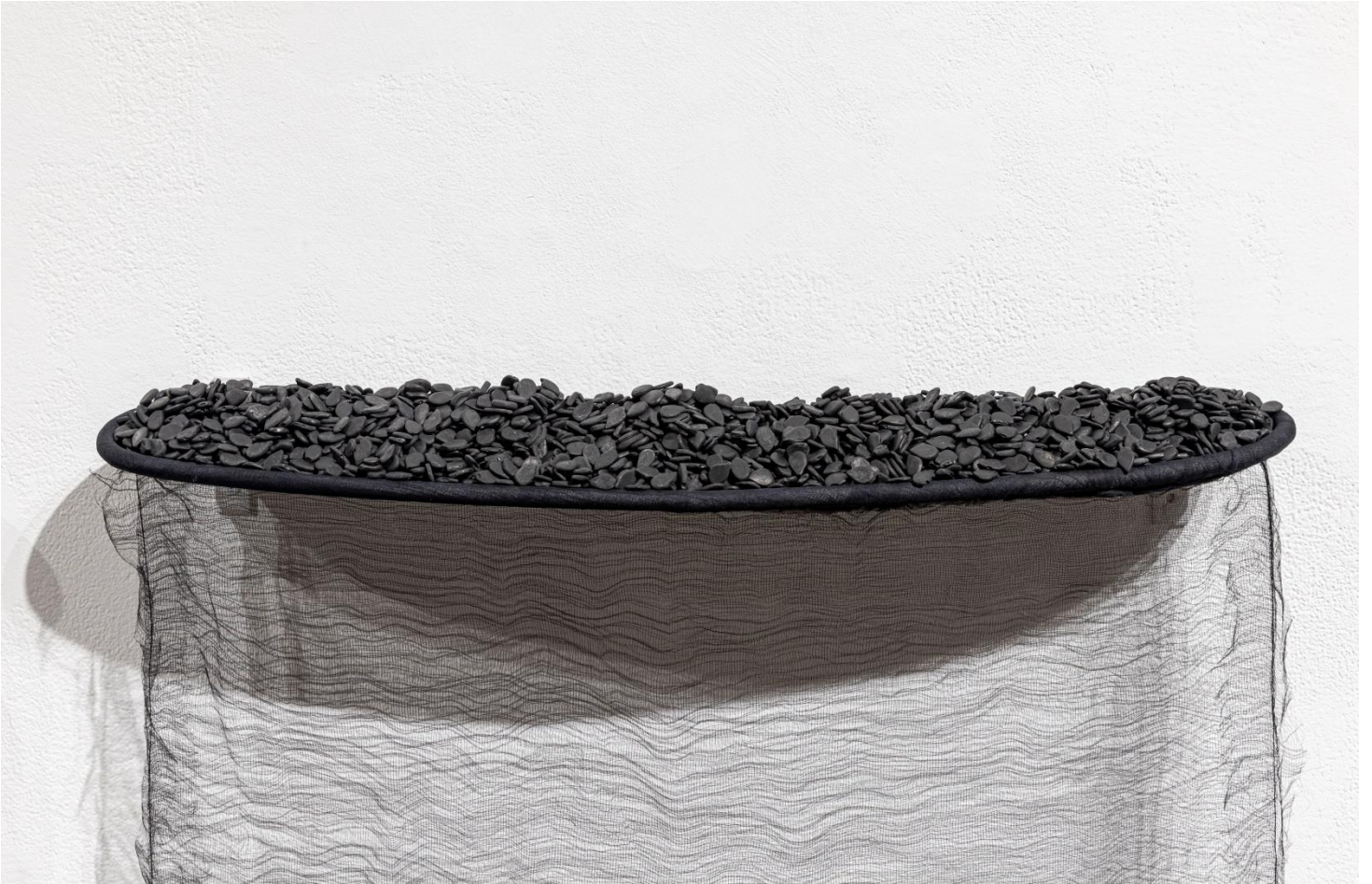
Beth Stuart detail of Delible (watermelon) , 2024