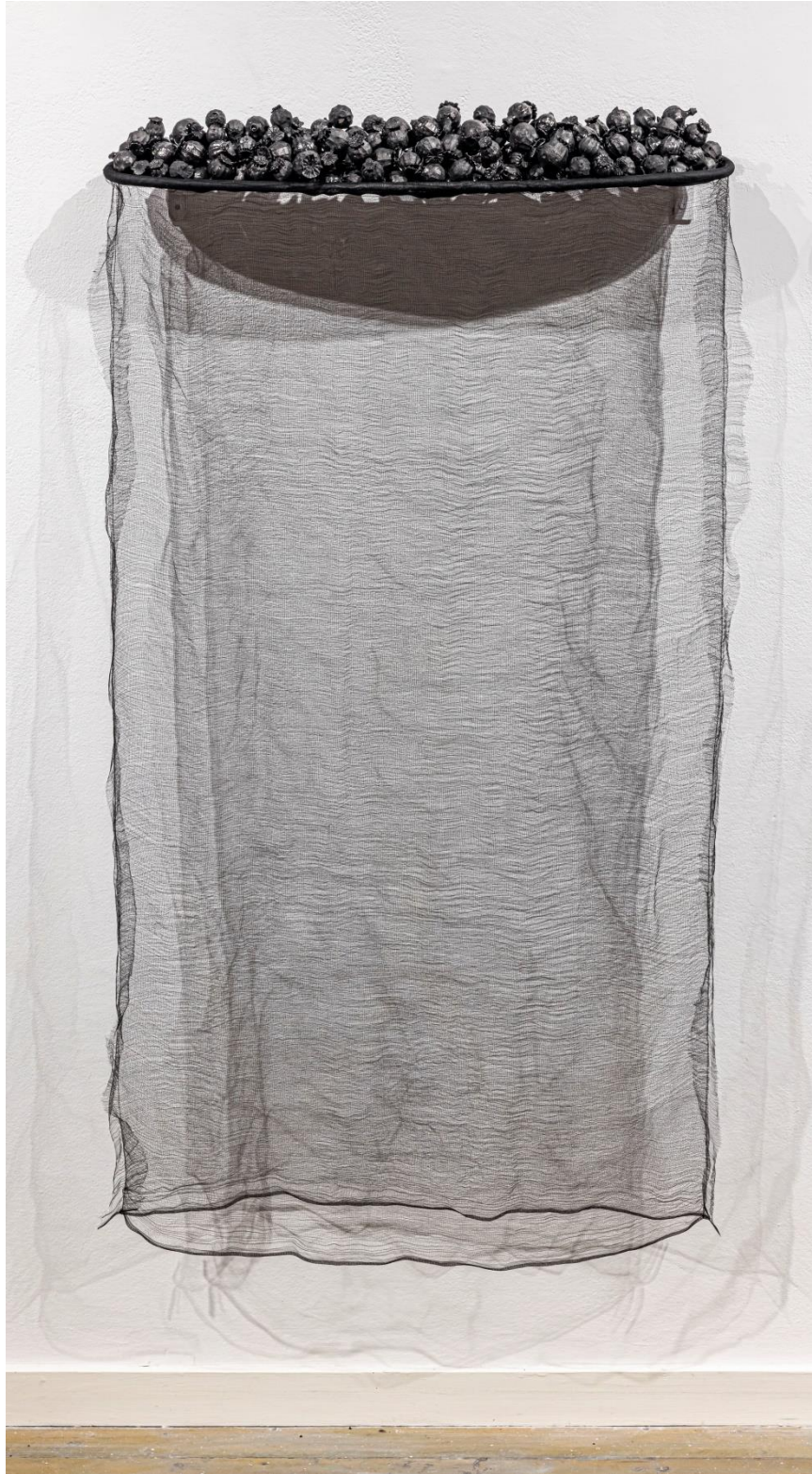
Beth Stuart Delible (poppy) , 2024 plaster, iron oxide pigment, dyed silk, steel, sumi ink 48 1/8 x 24 x 3 7/8 in. (117 x 61 x 10 cm)