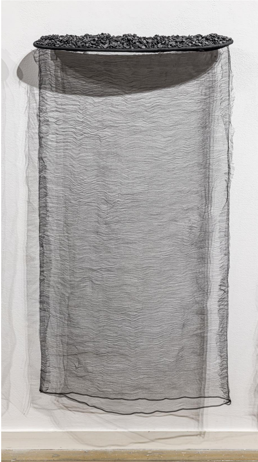
Beth Stuart Delible (watermelon) , 2024 plaster, iron oxide pigment, dyed silk, steel, sumi ink 48 1/8 x 24 x 3 7/8 in. (117 x 61 x 10 cm)