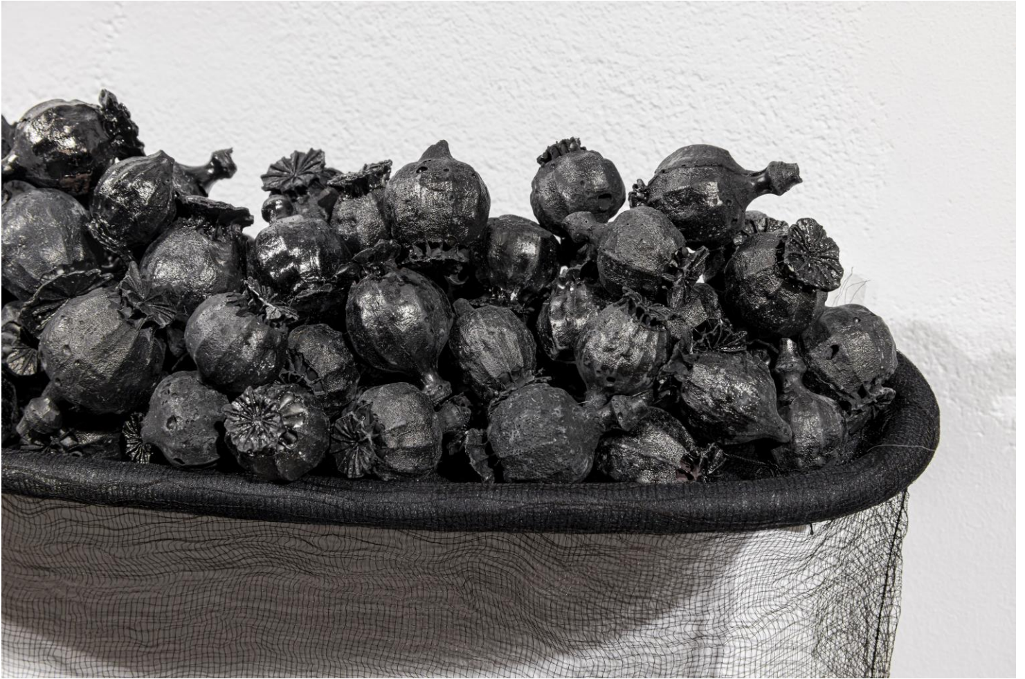
Beth Stuart detail of Delible (poppy) , 2024