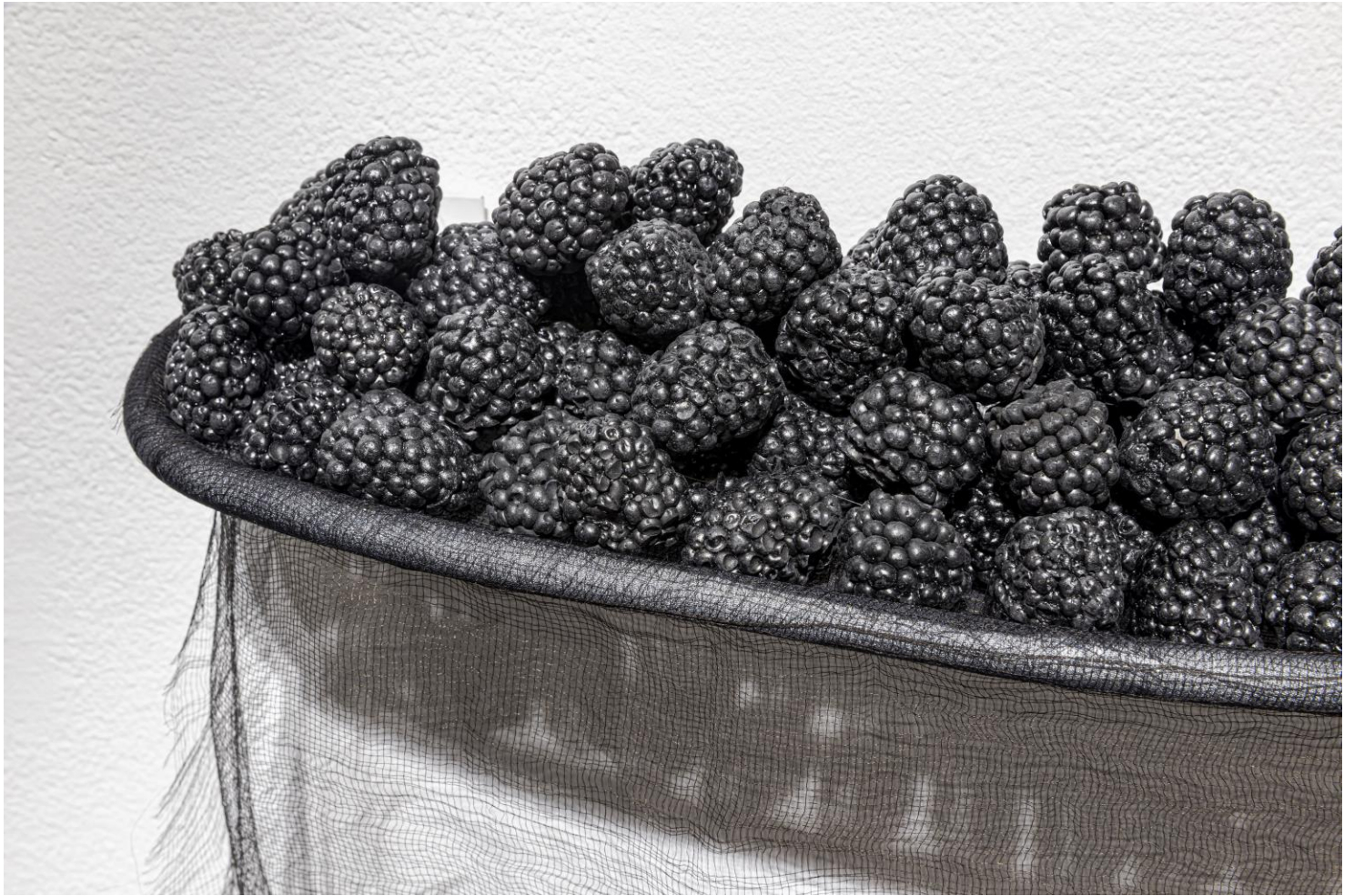
Beth Stuart detail of Delible (blackberry) , 2024