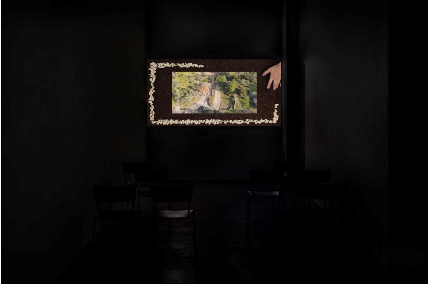
Beth Stuart still from Zanana - White Peace , 2024