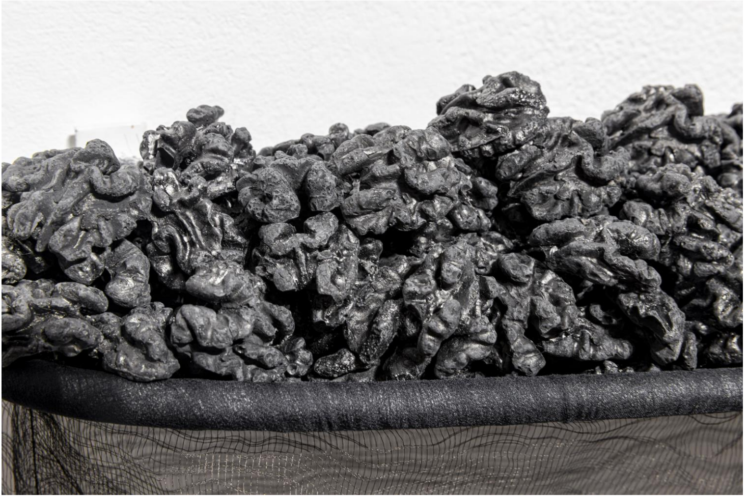
Beth Stuart detail of Delible (walnut) , 2024