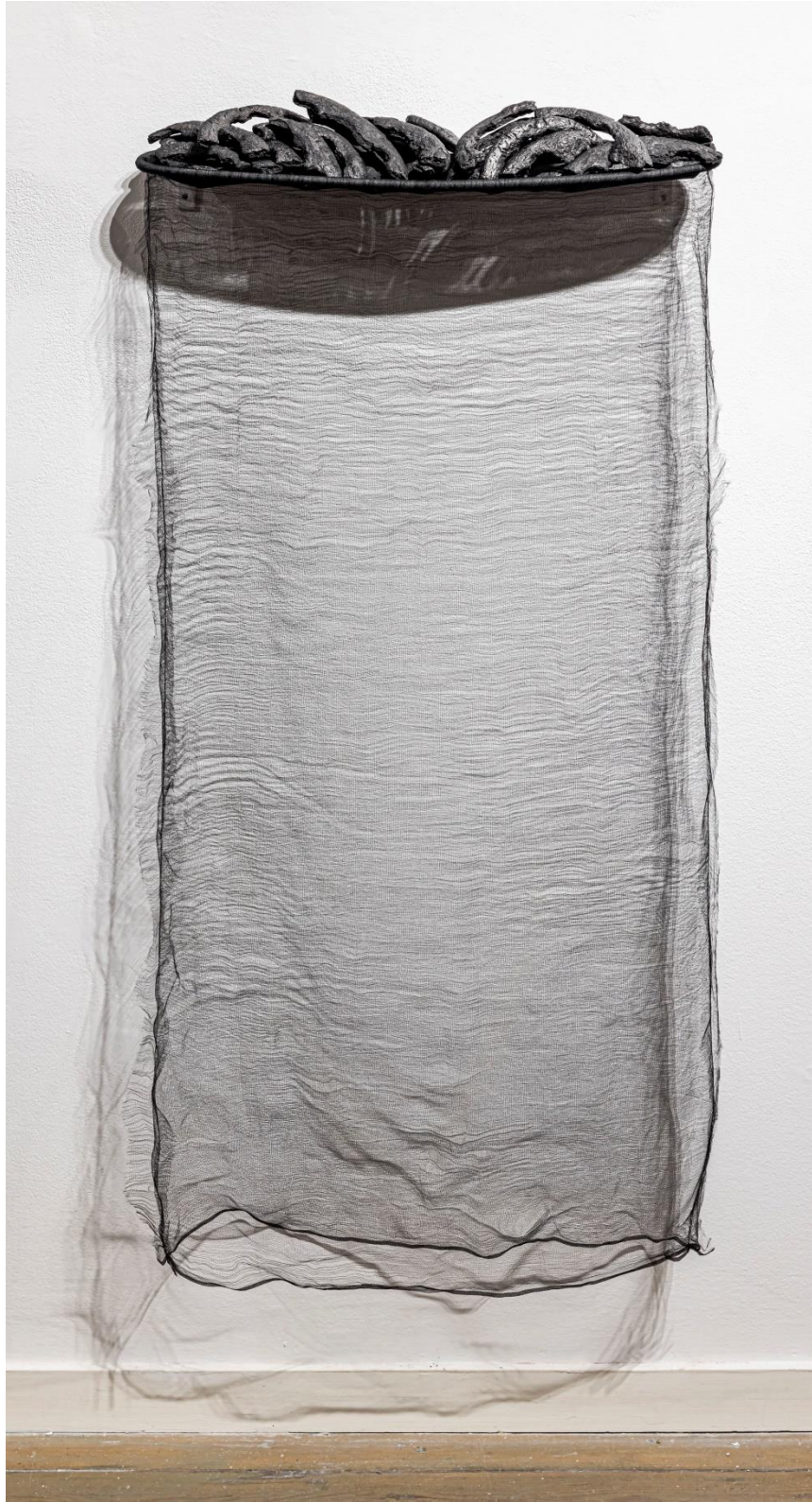
Beth Stuart Delible (wheat) , 2024 plaster, iron oxide pigment, dyed silk, steel, sumi ink 48 1/8 x 24 x 3 7/8 in. (117 x 61 x 10 cm)