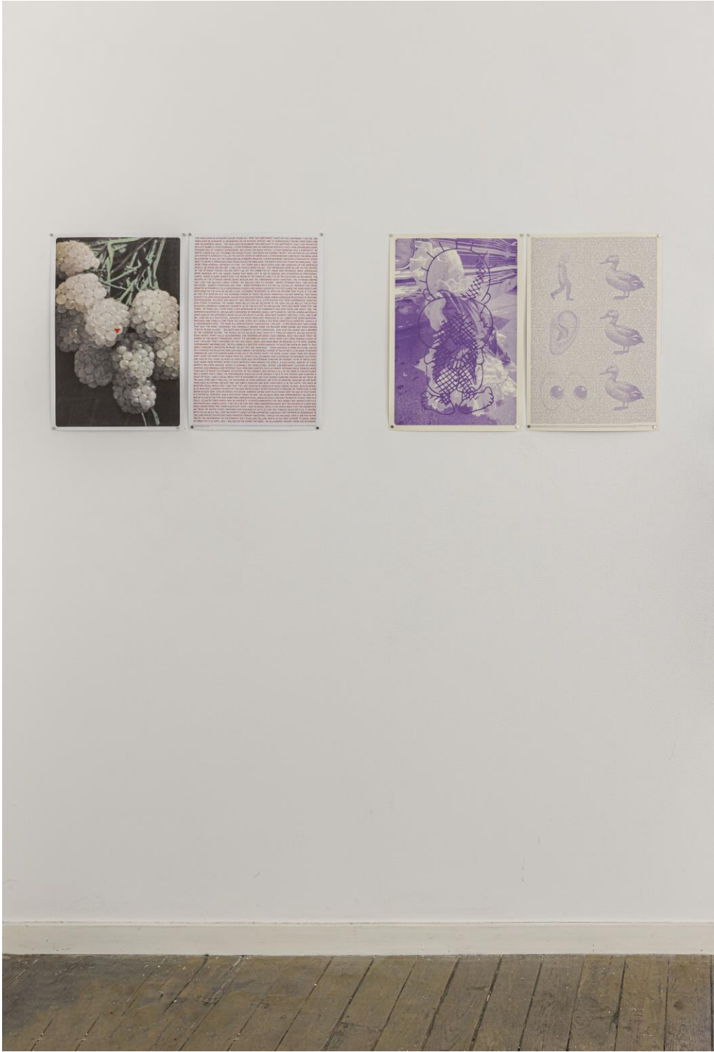
Beth Stuart installation view