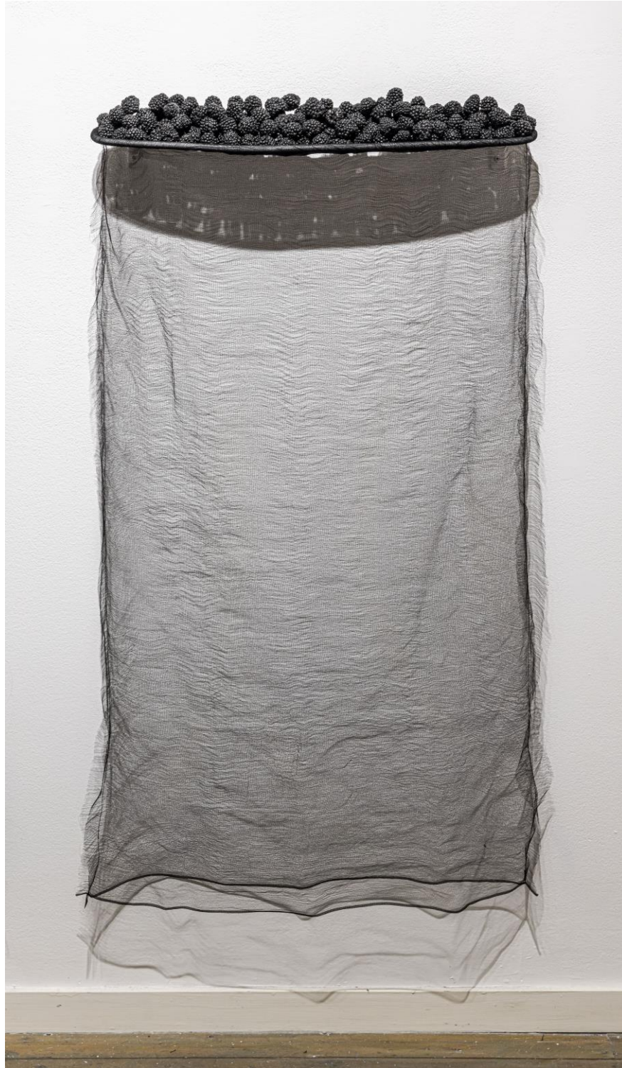
Beth Stuart Delible (blackberry) , 2024 plaster, iron oxide pigment, dyed silk, steel, sumi ink 48 1/8 x 24 x 3 7/8 in. (117 x 61 x 10 cm)