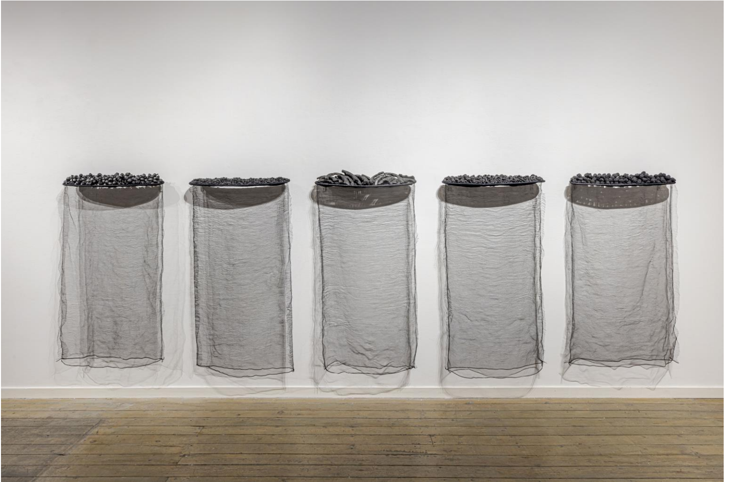
Beth Stuart installation view