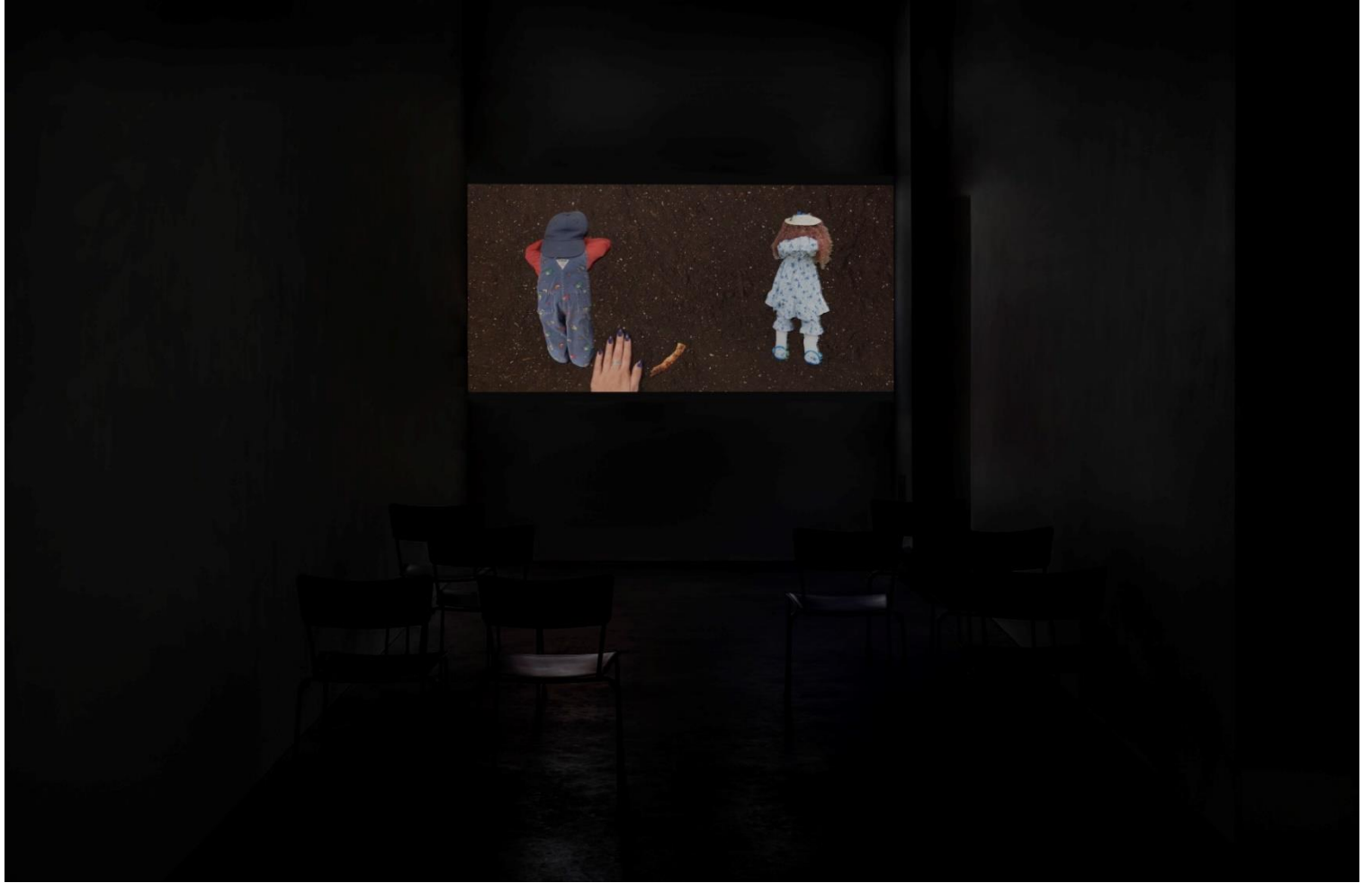
Beth Stuart still from Zanana - White Peace , 2024 single-channel video, edition of 3