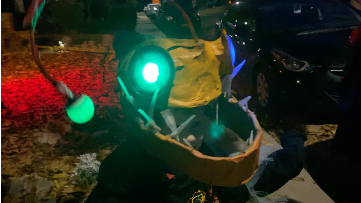
Lucian Löffler Long as an Anglerfish, 31 October 2024

produce their own kind of costuming: a sac of glowing bioluminescent bacteria that provides the illusion of light. Another species has a stomach with capacity to distend after overconsumption. Rewarded for its gluttony, the lining of its stomach is black to mask the bioluminescence of its prey to avoid becoming the object of another's hungry eyes. Even in the deep, illusion—or abstraction—can be a trap with consequences.