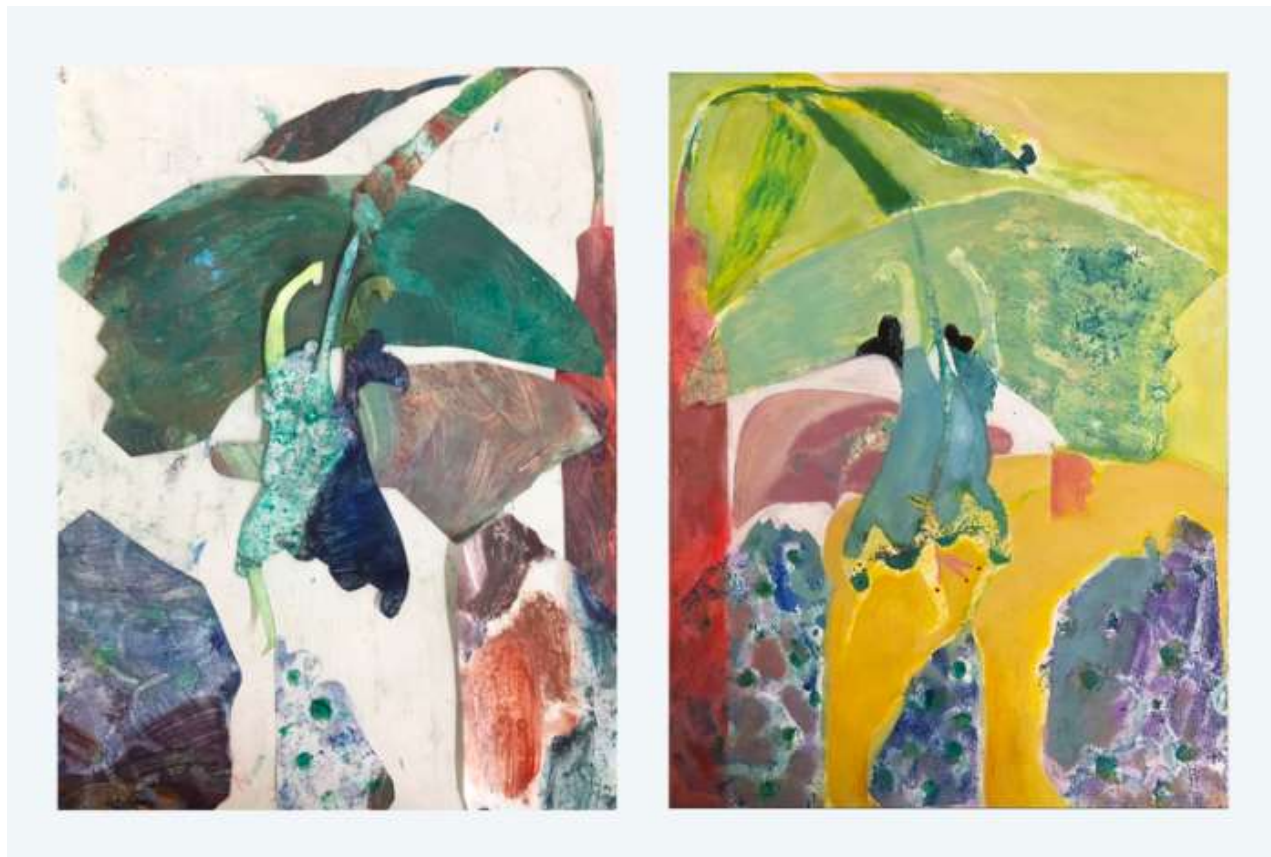
Swing Sisters I & II , oil and collage on paper, 30.5 x 23 cm each

I really like how the mirroring process plays both a defamiliarizing role and one of connection (family, lover, etc), highlighting the paradoxical and layered outcomes of a process. It strikes me that figures and architectures, shapes and spaces in your paintings are all integral to each other, sometimes flowing seamlessly, sometimes echoing, but definitely fitting together - not exactly like a puzzle - but with a certain inevitability. Can you say a few words about this?