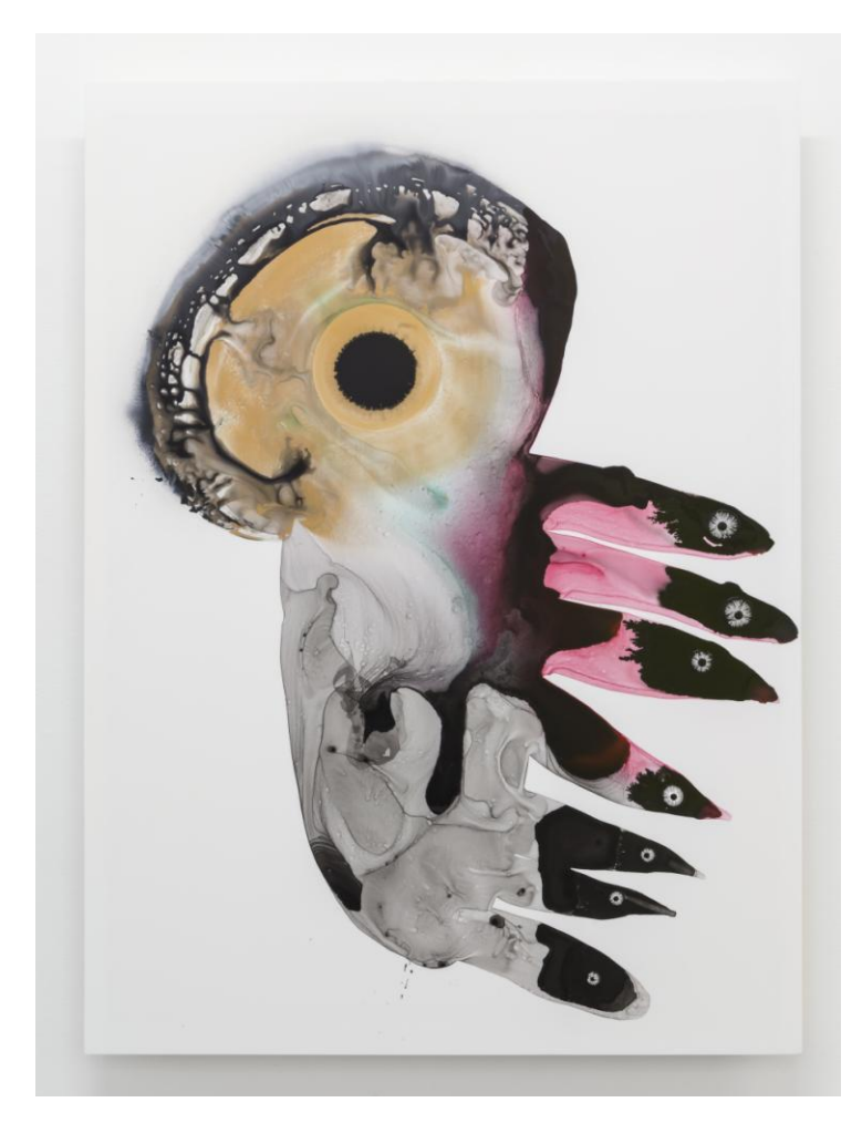
Ryan Peter Untitled, 2010 acrylic and spray paint on Plexiglas 122 x 91.5 cm