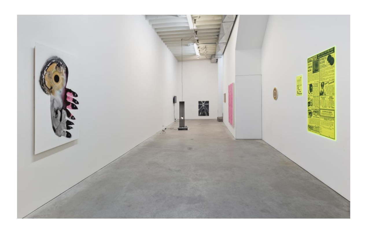
Magenta wants to push physical reality to its leaky margins Installation View, 2014