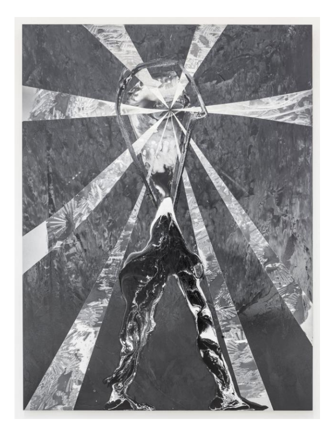
Ryan Peter Untitled, 2014 acrylic and spray paint on Plexiglas 101.5 x 76 cm