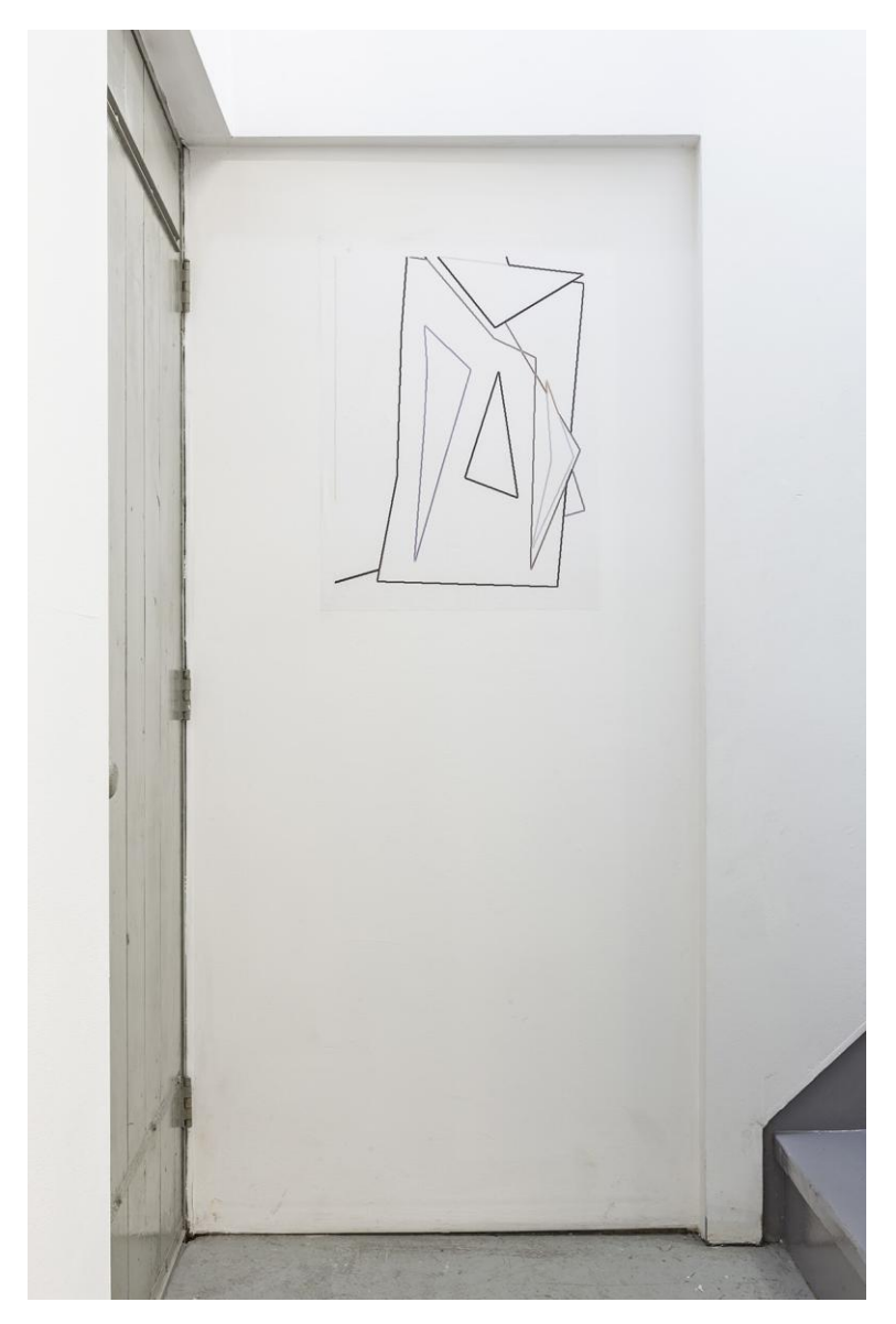
Patrick Howlett The higher you get the higher you get, 2008 1/10 digital print 62 x 47 cm