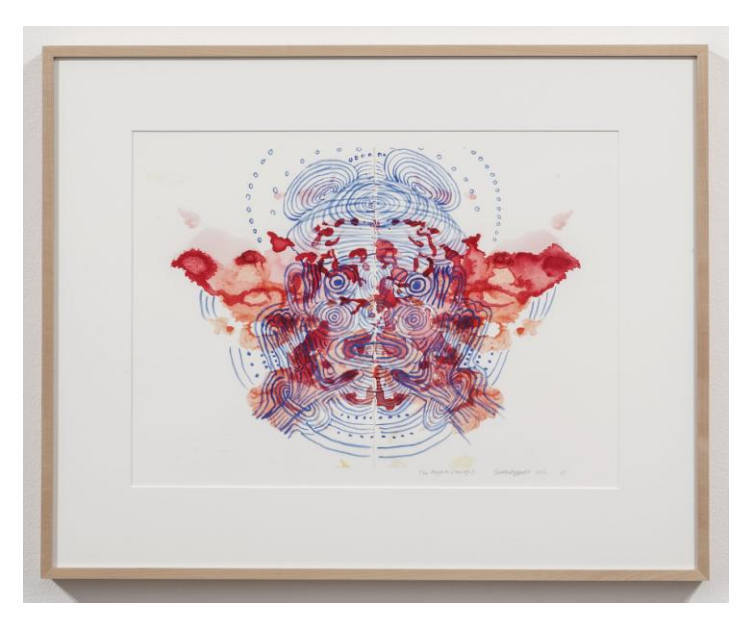
Sandra Meigs The Morphine Drawings (5), 2012 digital archive print 35.5 x 51 cm