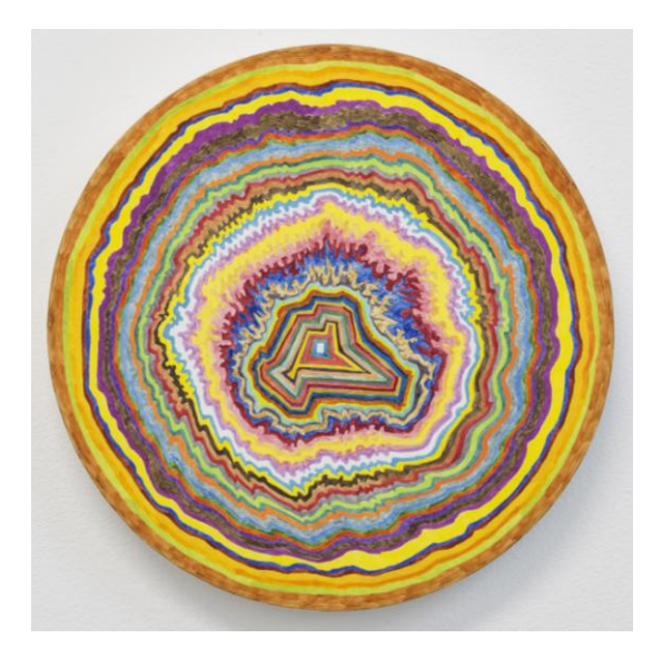
Patrick Howlett Untitled, 2007 tempera on panel 30 cm in diameter