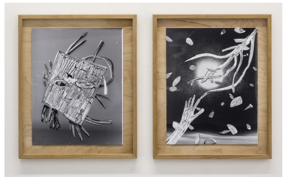
Ryan Peter Untitled (from the series AUTOGRAMS), 2014 Untitled (from the series AUTOGRAMS), 2014 unique gelatin silver print, vintage wood frame 35.5 x 28 cm each