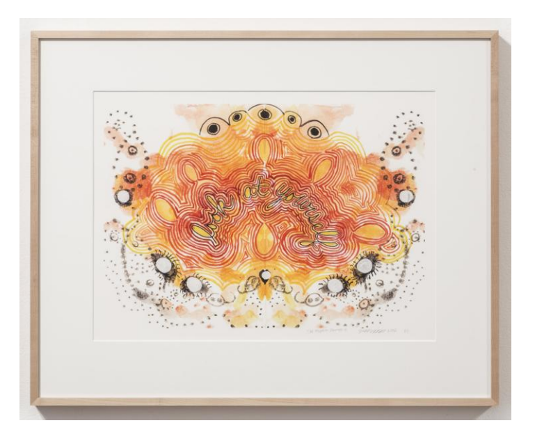
Sandra Meigs The Morphine Drawings (4), 2012 digital archive print 35.5 x 51 cm