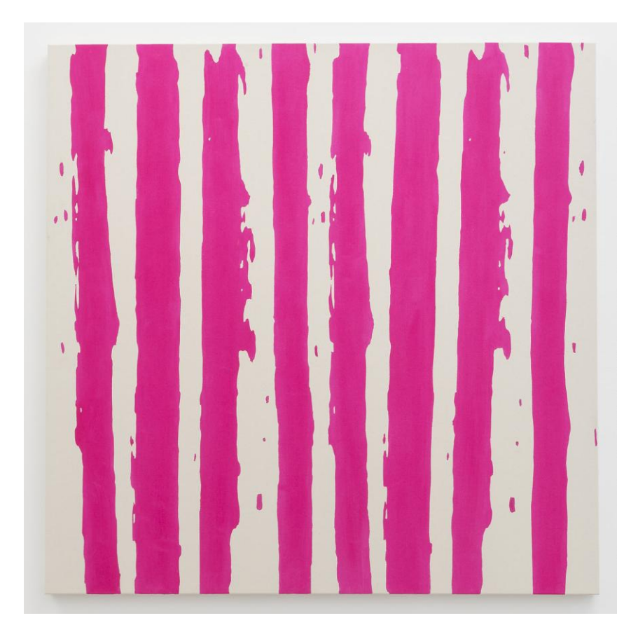
Steve Lyons S.C. 08 (Magenta), 2014 DayGlo fabric paint on canvas 17 x 17 buren units 148 x 148 cm