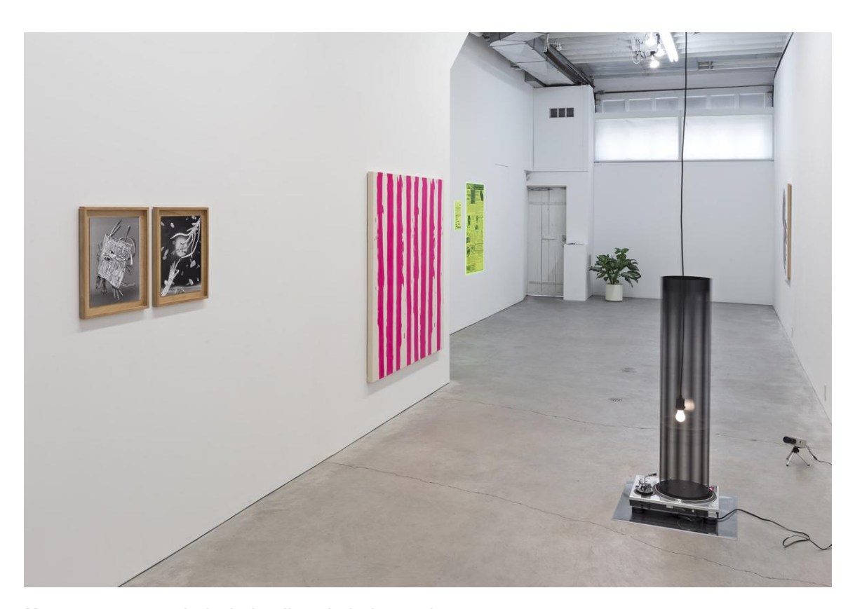
Magenta wants to push physical reality to its leaky margins Installation View, 2014