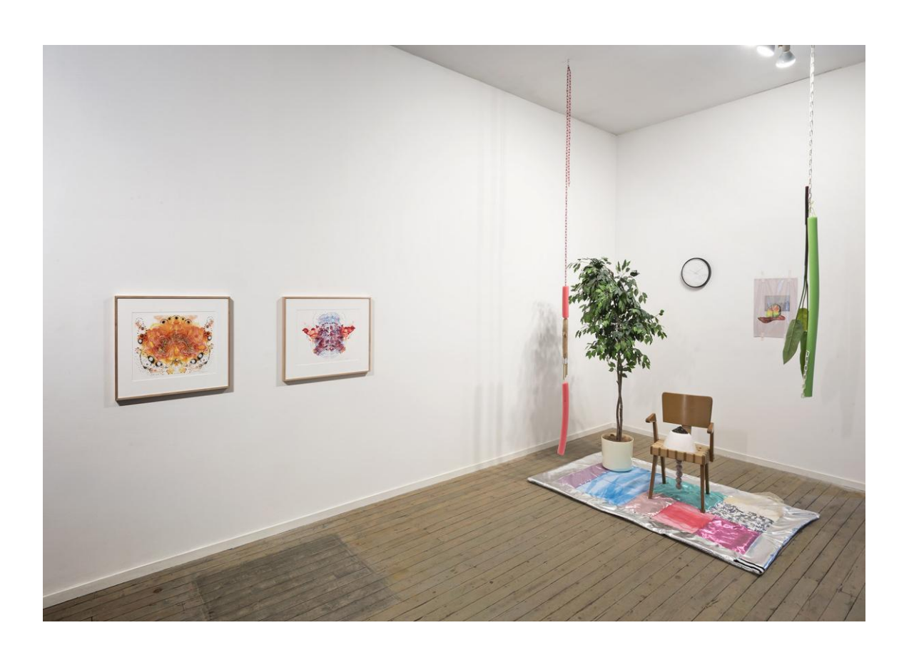
Magenta wants to push physical reality to its leaky margins Upstairs Installation View, 2014