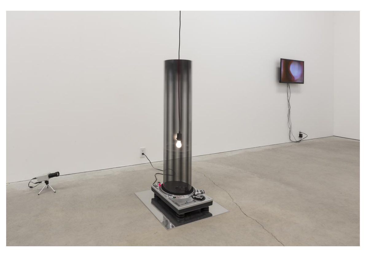
Steve Lyons SPECULATIVE COLLABORATIONS / EXH-01, 2014 comprised of S.C. 01 (v. 1) 2014 CCTV camera, tripod S.C. 03 (v. 1) 2014 turntable, inkjet print on film, light fixture, Plexiglas, two-way mirror film