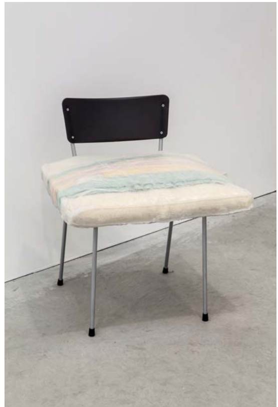
Liz Magor Heavenly Wool Blanket , 2013 wool, platinum cure silicon rubber 71 x 54.5 x 11.5 cm