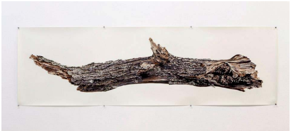
Robert Wiens Log , 2013 gouache on paper 51 x 178 cm