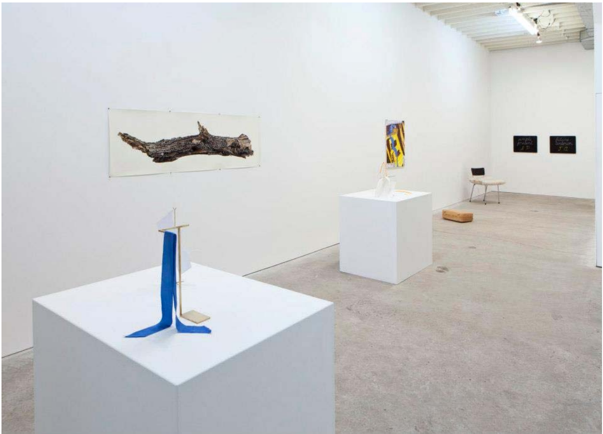
Simple Present, Future Anterior: a 20 th anniversary show Installation view