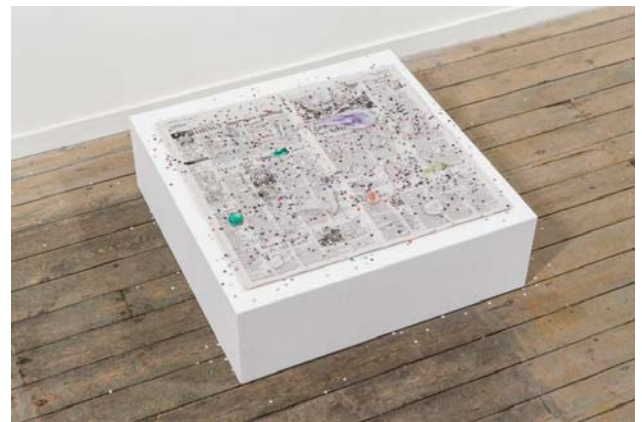
Oliver Husain Whale vomit worth its weight in gold , 2013 newspaper, glass shards 23 x 195 x 96.5 cm