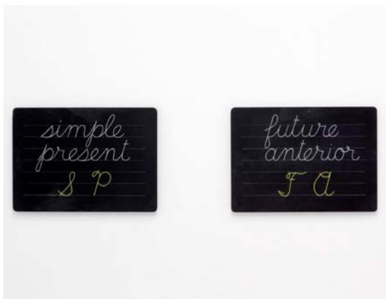
Ian Carr-Harris Writing (language series): simple present , 2013 Writing (language series): future anterior , 2013 masonite, oil 45 x 63 x 2.5 cm each