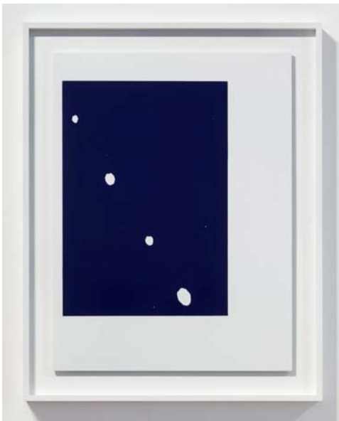
Brian Groombridge 47 degrees 22 minutes 17 seconds N, 8 degrees 32 minutes 37 seconds E , 2004 painted aluminum 81 x 64 cm