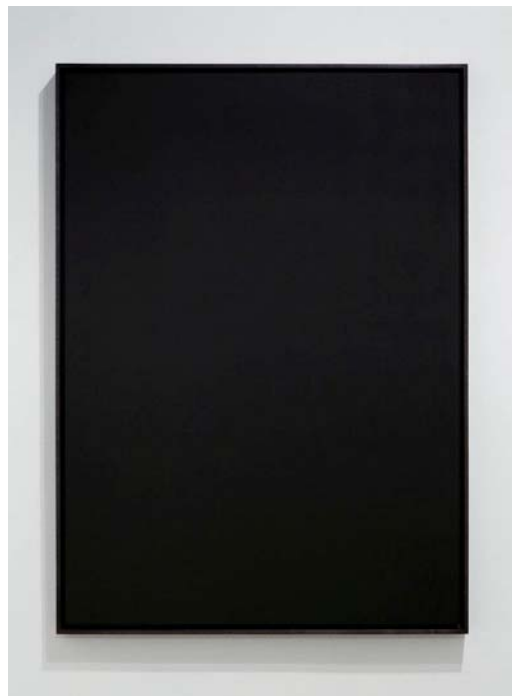
Scott Lyall Untitled (mirror) , 2011 ink on glass 124 x 89 cm