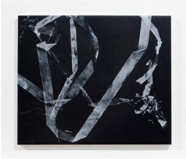
Shirley Witasalo Ribbon , 2012 acrylic on linen 51 x 61 cm