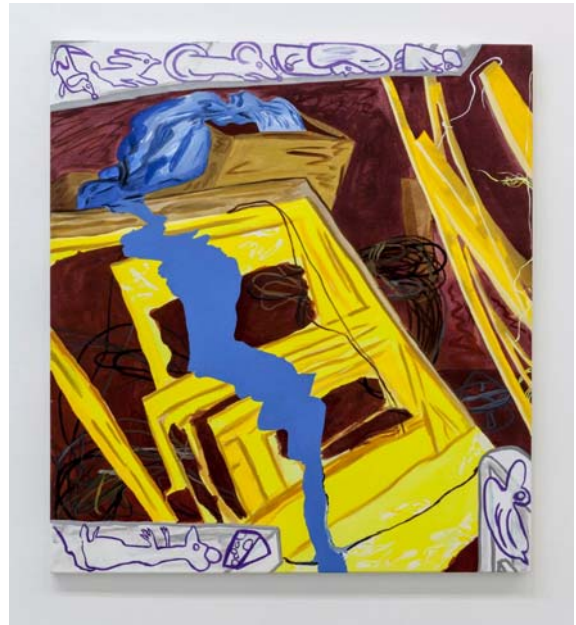
Sandra Meigs Frame Pile , 2012 acrylic on canvas 84 x 74 cm