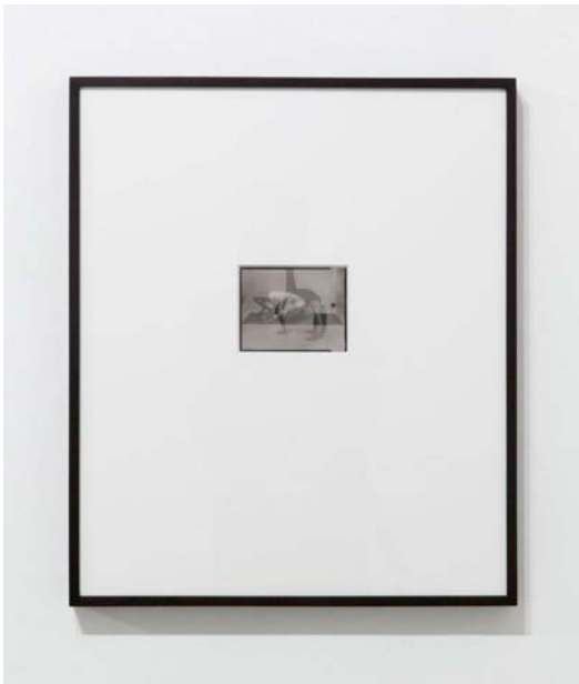
Althea Thauburger Anatomie Artistique , 2011 platinum/palladium print 21.5 x 28 cm