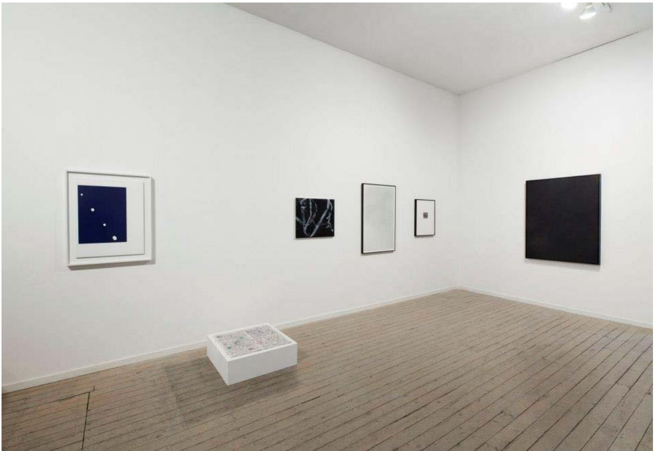
Installation view – second floor