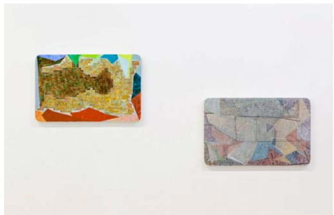
Patrick Howlett you can always come back (but you can't come back all the way) , 2012 egg tempera on wood panel 30 x 46 cm the future for me is already a thing of the past , 2012-13 egg tempera on wood panel 30 x 46 cm