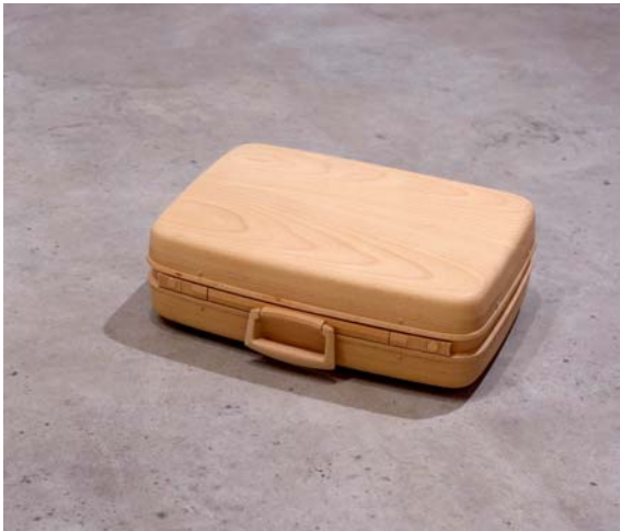
Kevin Yates Suitcase , 2006 beech wood 15 x 50 x 38 cm