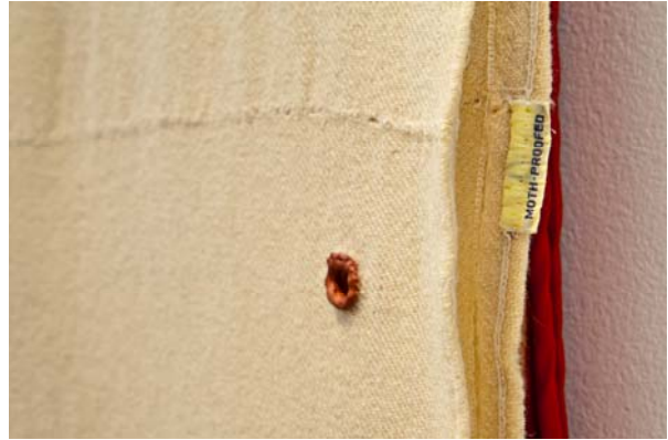
Liz Magor Moth-proofed , 2011 wool, hair, metal, plastic, polymerized gypsum, and thread 168 x 56 x 7 cm