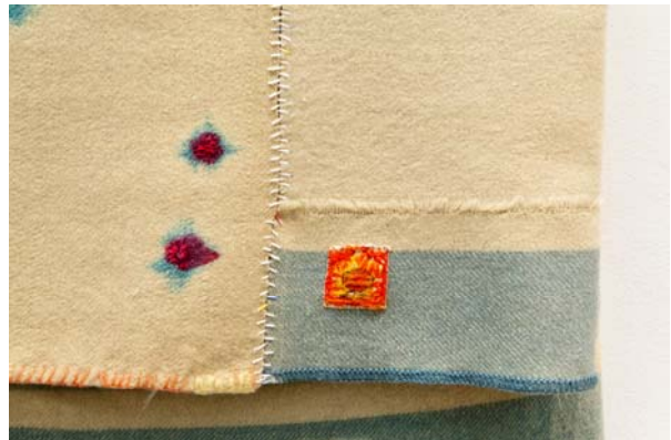
Liz Magor Maple Leaf , 2011 wool, dye, fabric, metal, plastic, and thread 147 x 62 x 10 cm