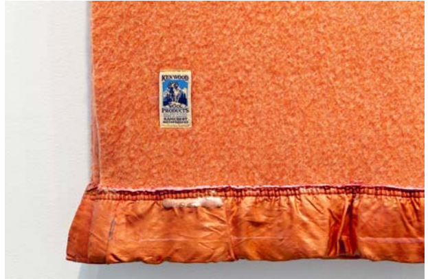
Liz Magor Kenwood (salmon) , 2011 wool, fabric, plastic, and polymerized gypsum 116 x 54 x 13 cm