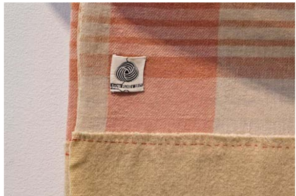
Liz Magor Laurentian/Woolmark , 2011 wool, fabric, paper, plastic, and metal 142 x 56 x 11 cm