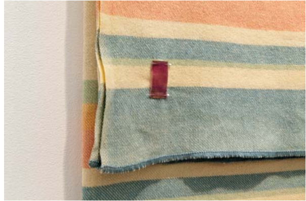
Liz Magor Mossfield Twins , 2011 wool, fabric, metal, paper, and plastic 136 x 100 x 6 cm