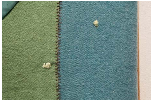
Liz Magor Modella/Everest , 2011 wool, fabric, metal, thread, and wood 156 x 67 x 10 cm