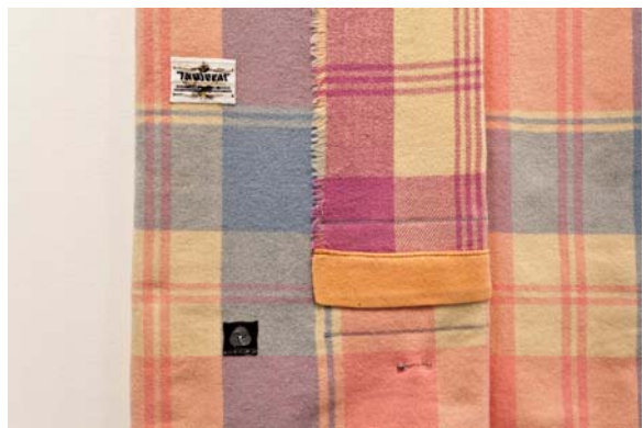
Liz Magor Eatonia , 2011 wool, fabric, metal, and thread 145 x 62 x 6 cm