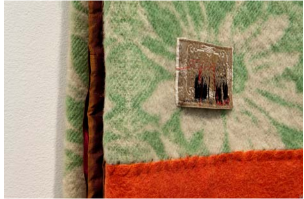
Liz Magor Chinese Green , 2011 wool, fabric, metal, thread, and wood 149 x 63 x 12 cm