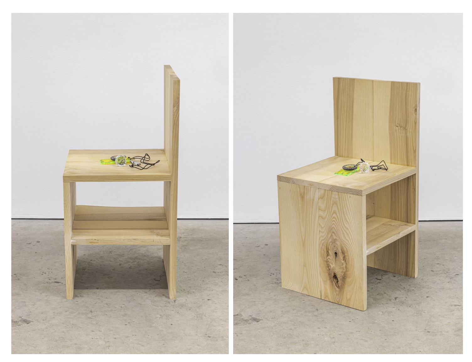
Derek Sullivan Unfinished Sculpture, 2024 wood, compass, whistle, crystal, cord 30 x 15 x 15 in. (78 x 38 x 38 cm)