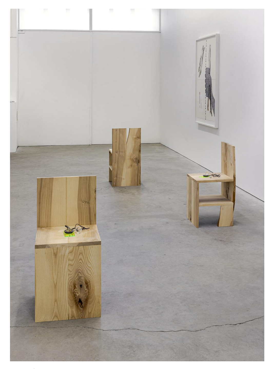
Derek Sullivan Field Works installation view, 2024