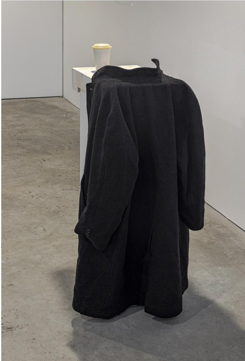
Liz Magor Overcoat , 2023 wool garment, polymerized gypsum, plywood, wire, polyfibre moths 112 x 43 x 58.5 cm