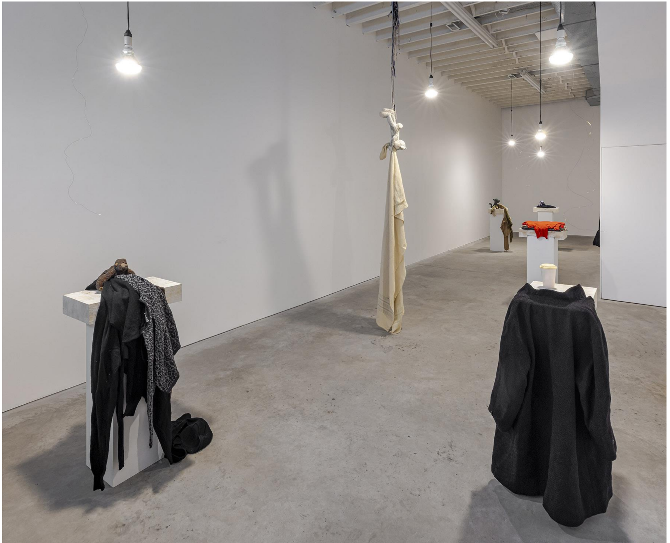
Liz Magor Style installation view, 2023