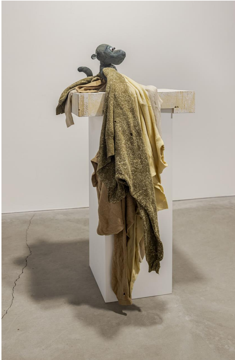
Liz Magor Jumpers (light) , 2023 wool garments, textile figures, plywood, wire, polyfibre moths 119.5 x 48.5 x 61 cm