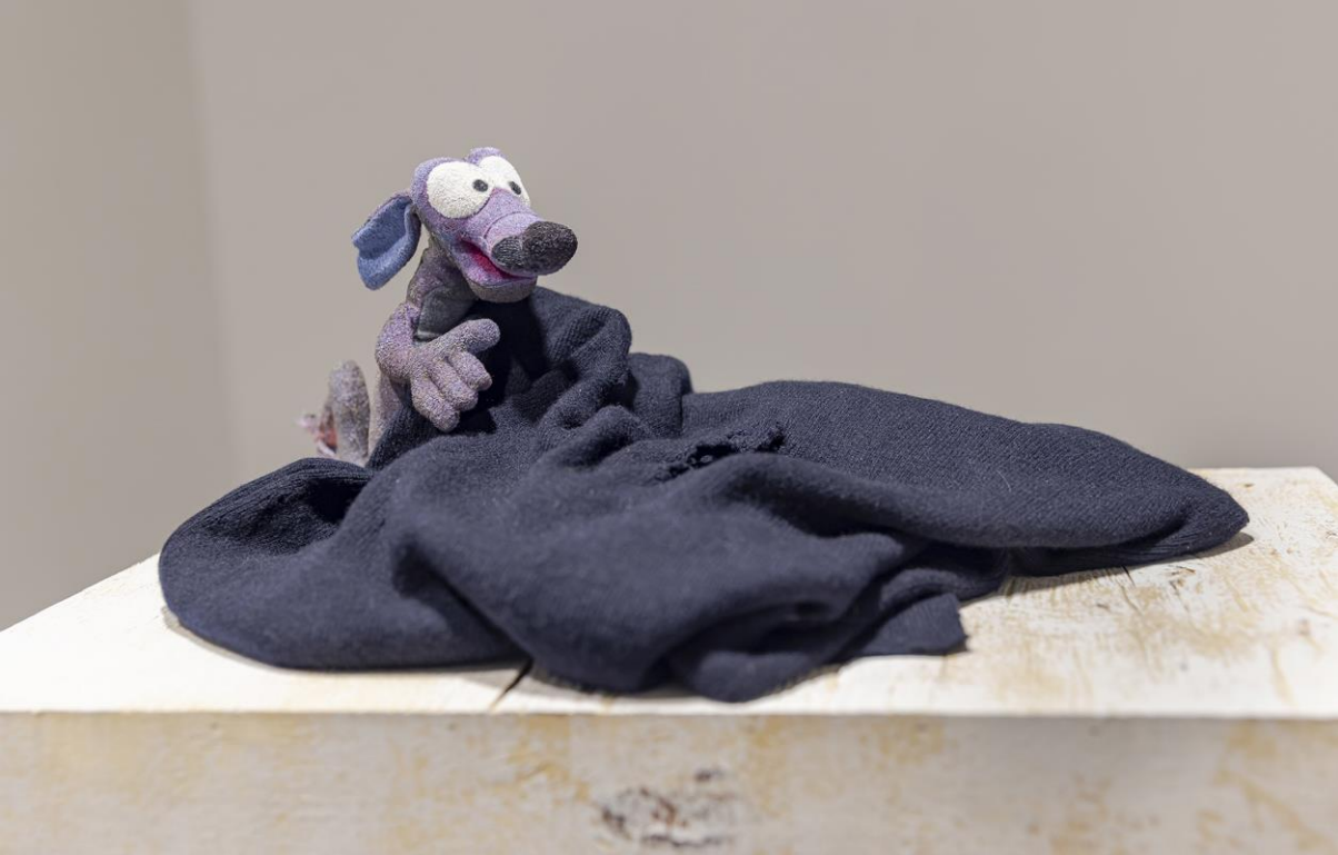
Liz Magor detail of Pencil Skirt , 2023