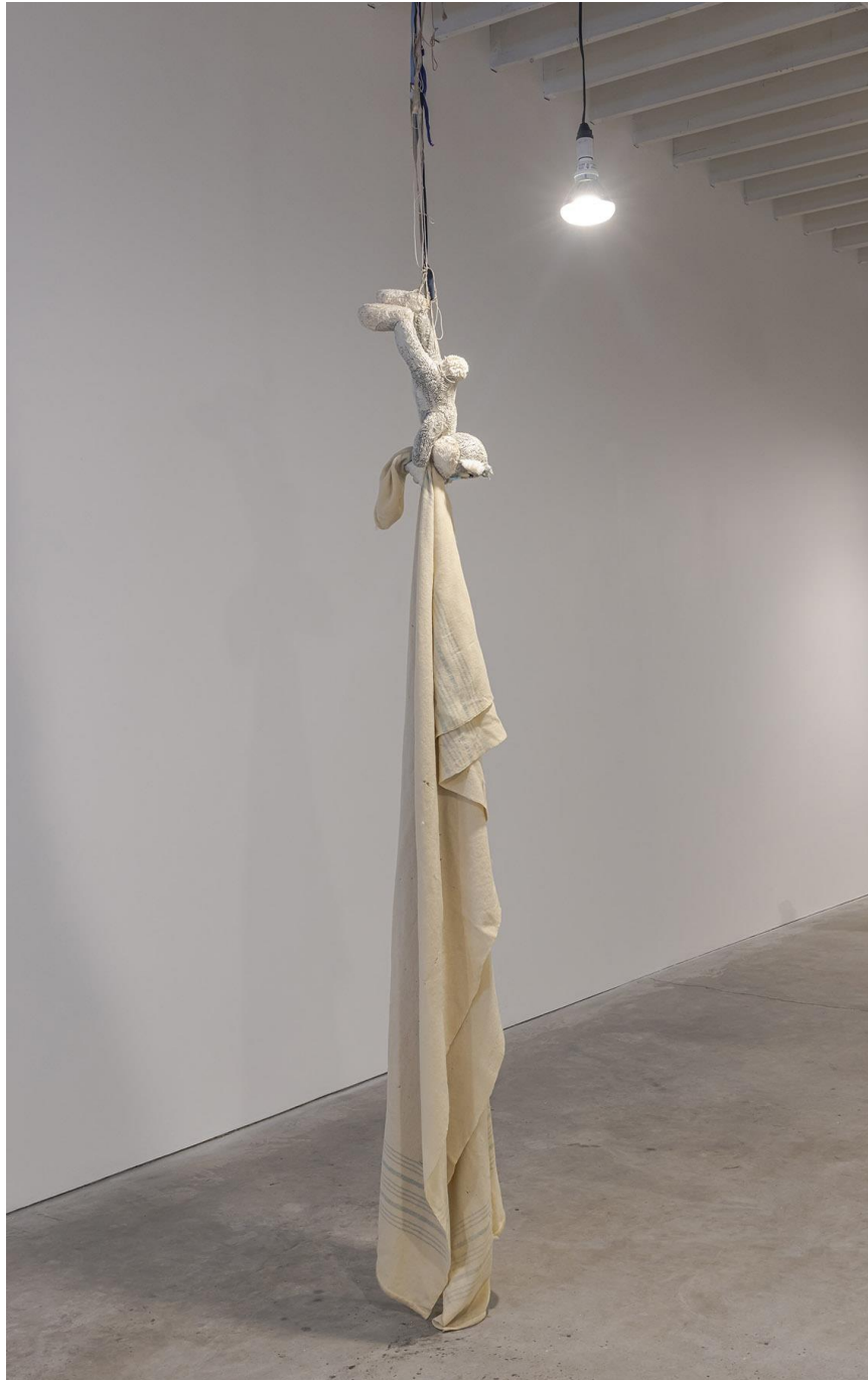
Liz Magor Good Grace , 2018 wool, polyfibre moths, various textiles 396 x 38 x 48 cm