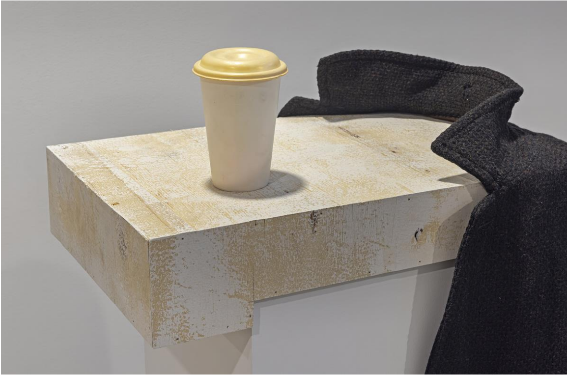
Liz Magor detail of Overcoat , 2023