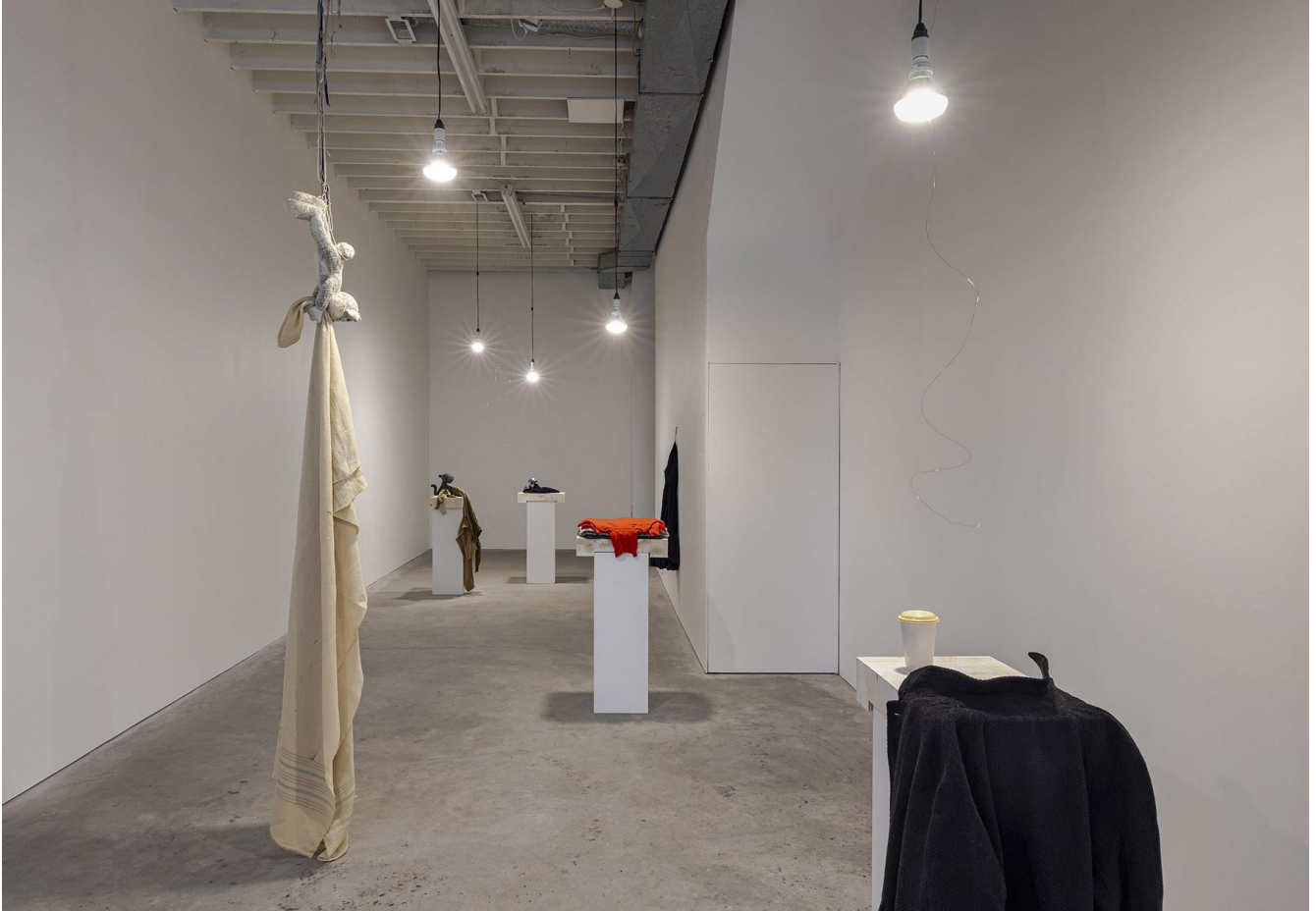
Liz Magor Style installation view, 2023