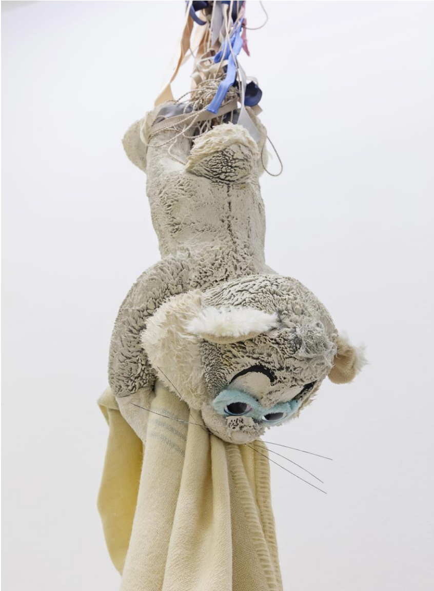
Liz Magor detail of Good Grace , 2018