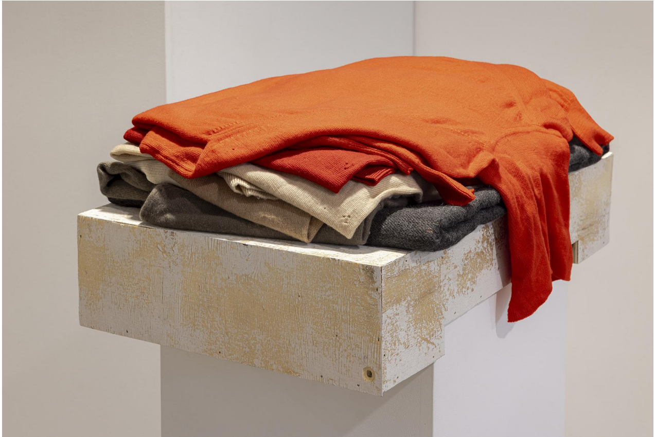
Liz Magor detail of Turtleneck (red) , 2023 cashmere garments, plywood, wire, polyfibre moths 106.5 x 51 x 35.5 cm