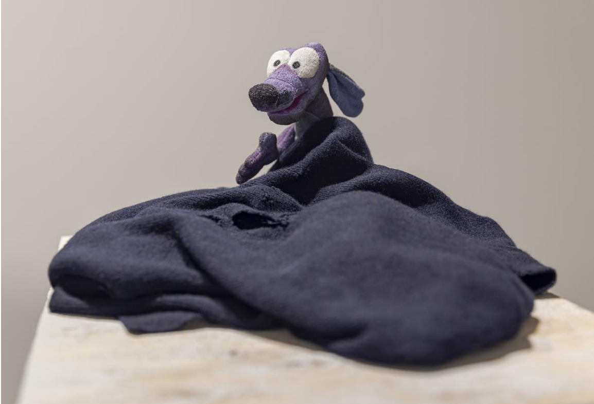
Liz Magor detail of Pencil Skirt, 2023 wool garments, textile figures, plywood, wire, polyfibre moths 112 x 51 x 33 cm