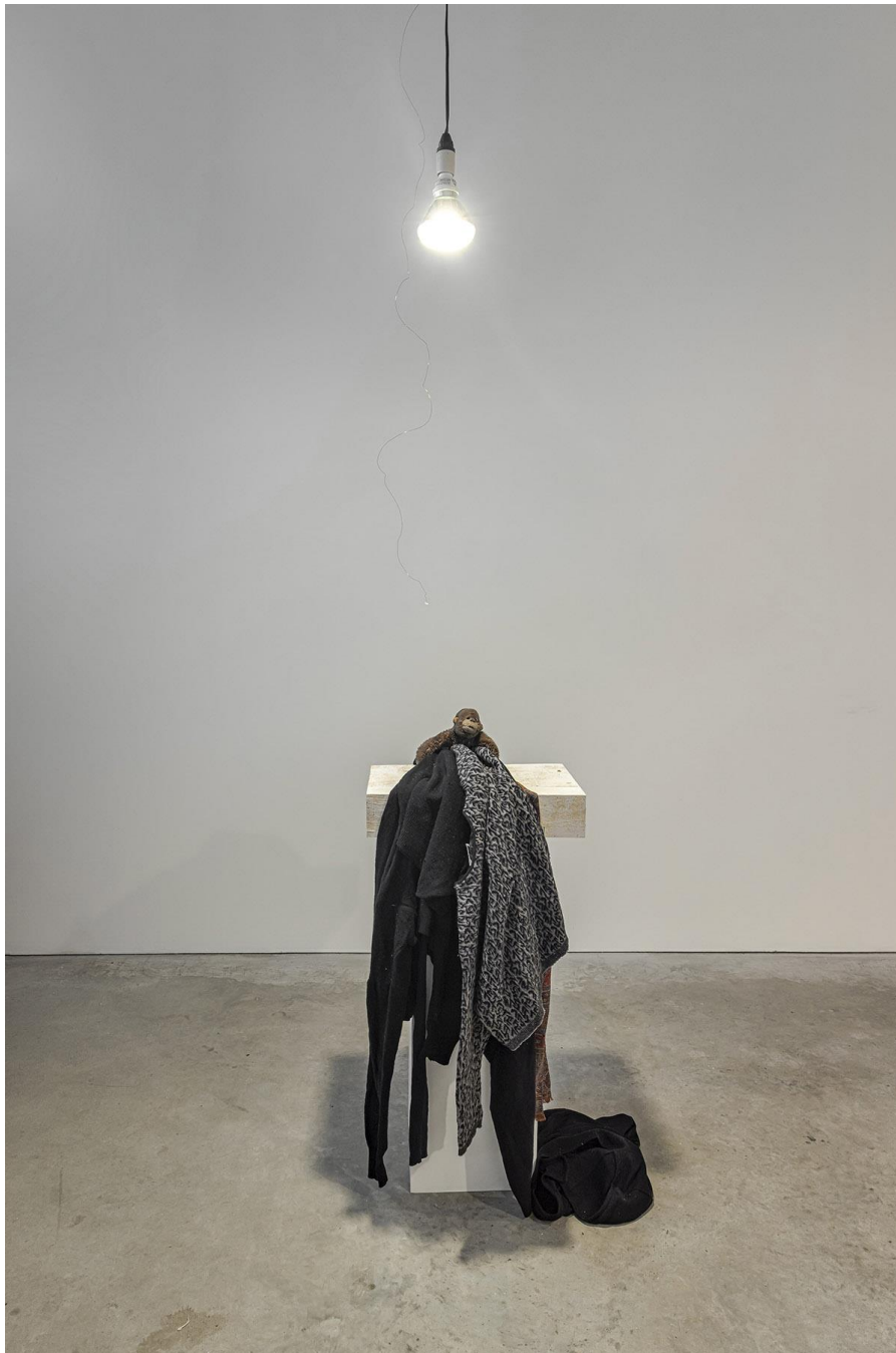
Liz Magor Jumpers (dark) , 2023 wool garments, textile figures, plywood, wire, polyfibre moths 114.5 x 56 x 73.5 cm