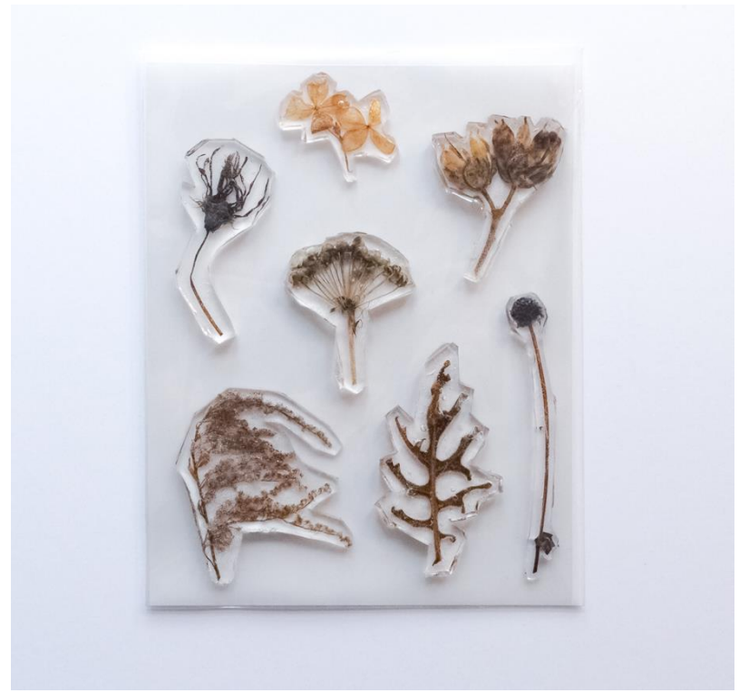
Winter Garden (Window Clings), Shannon Garden-Smith, 2019 Exhibited in Art Metropole's Something Borrowed, Something New: Gifts By Artists 2019