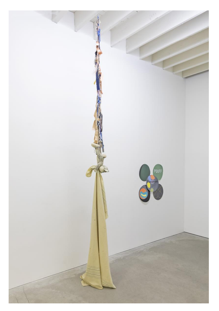
The Clock That Went Backward installation view, 2019

Liz Magor Good Grace, 2018 wool, various textiles dimensions variable