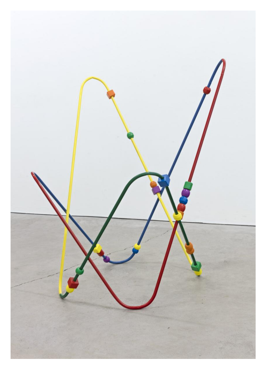
Gareth Long Stupid Learning Tool 1, 2016 steel, wood, paint 80 x 75 x 88 cm