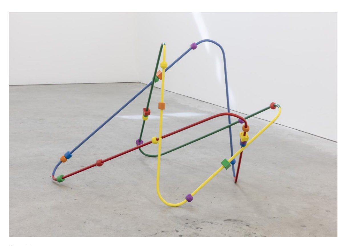
Gareth Long Stupid Learning Tool 2, 2016 steel, wood, paint 80 x 75 x 88 cm