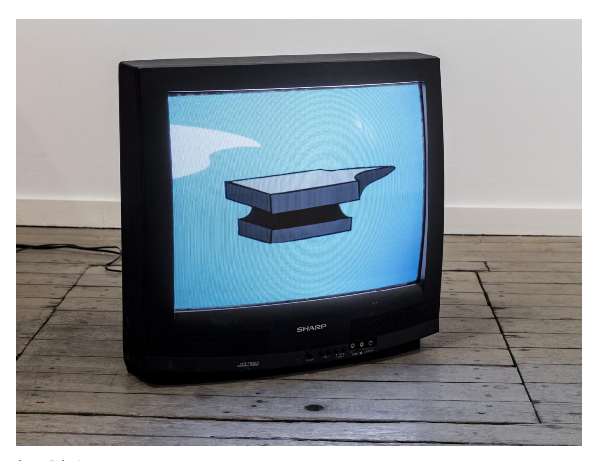
Grace Esford Anvil, 2016 2/3 digital video with sound