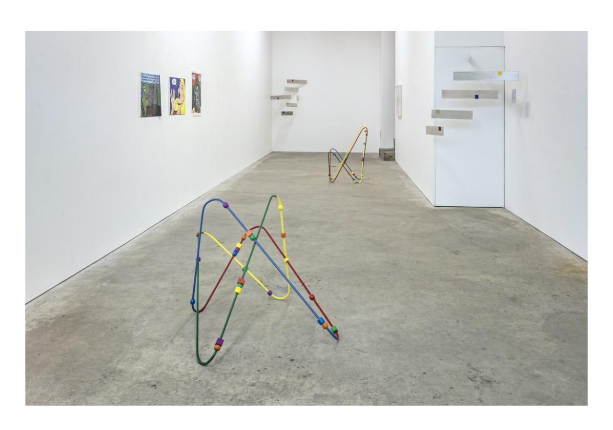
Gareth Long Square Peg Round Hole installation view, 2017