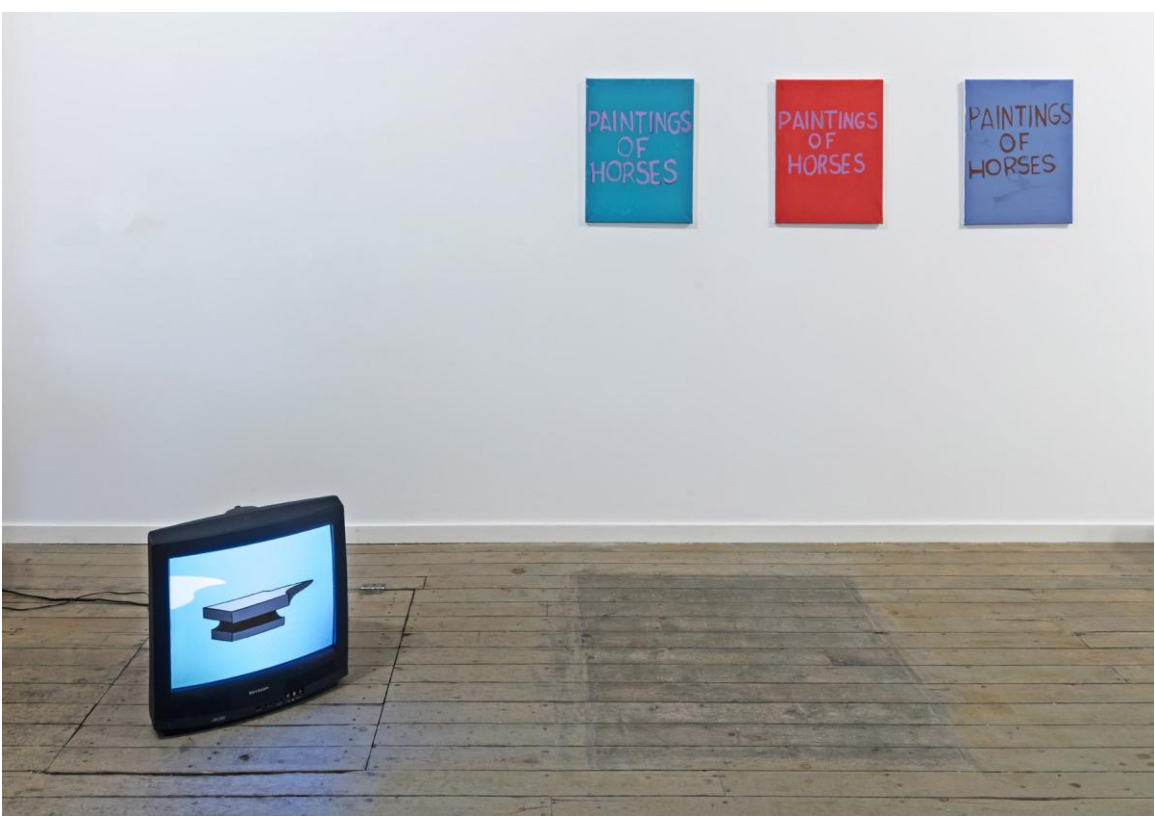
Square Peg Round Hole installation view upstairs, 2015