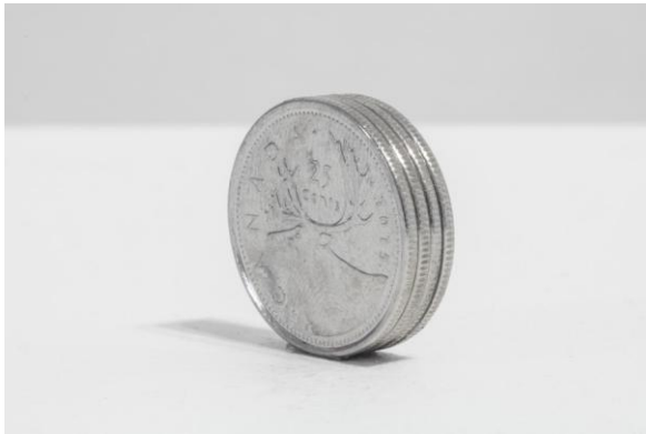
Jaimie Aitken In Lieu of a Loonie (Four Quarters Glued Together Because My Washing Machine Only Accepts Loonie), 2016 found materials