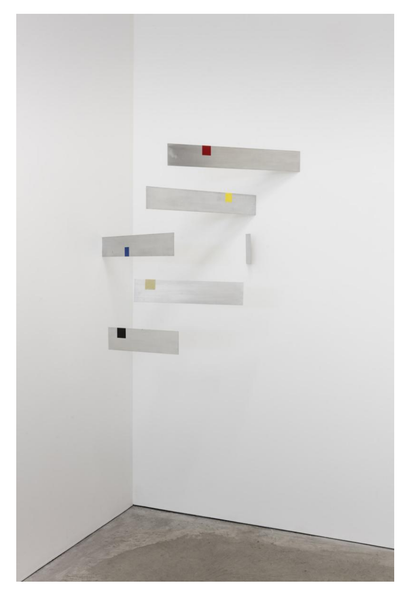
Gareth Long Literary Asses: Agon - (Munari & Midas), 2012 2/3 aluminum leaves, nylon, spray paint variable dimensions