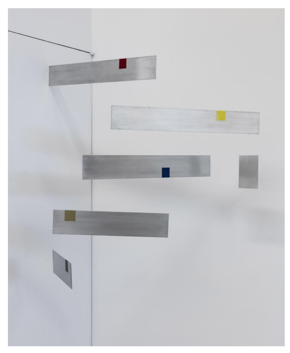
Gareth Long Literary Asses: Agon - (Munari & Midas), 2012 2/3 aluminum leaves, nylon, spray paint variable dimensions