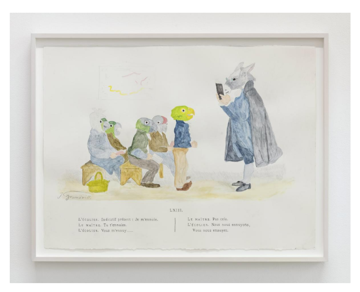
Gareth Long Conjugate the Present Indicative, I Am Bored, 2017 graphite and watercolour on paper 32.5 x 82 cm