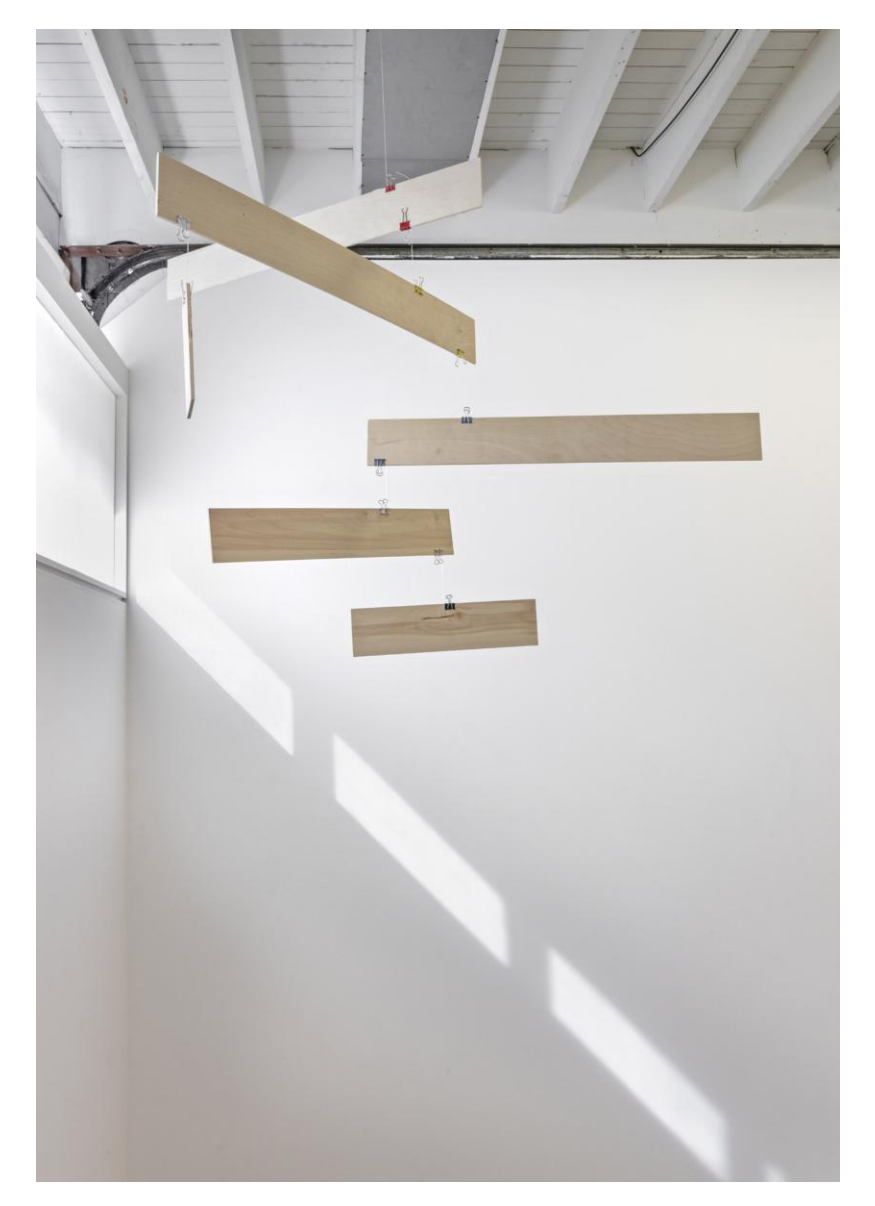
Gareth Long Munari Prototype, 2012 plywood leaves, binder clips, nylon variable dimensions