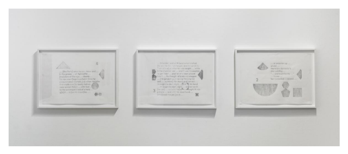
Square Peg Round Hole installation view upstairs, 2015