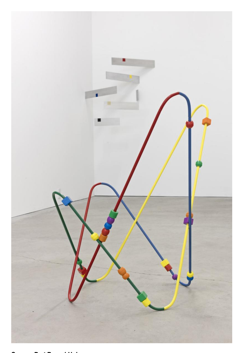
Square Peg Round Hole installation view, 2017