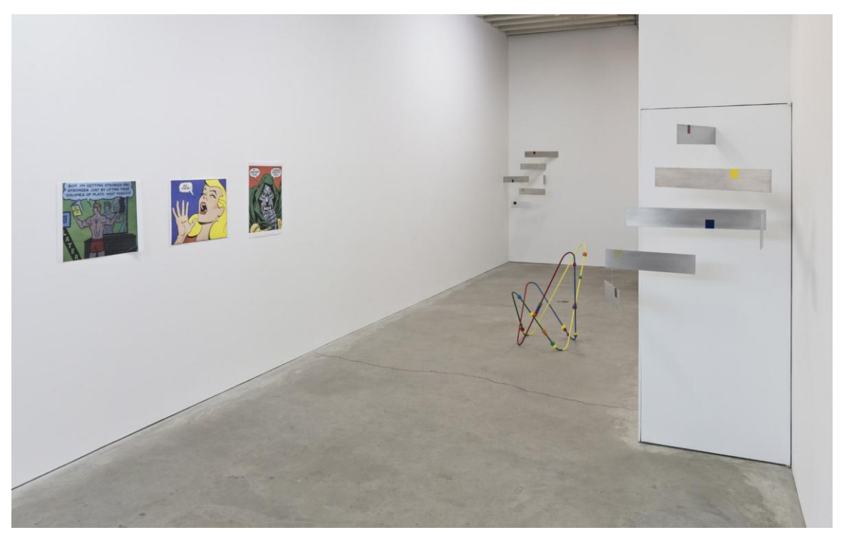
Square Peg Round Hole installation view, 2017