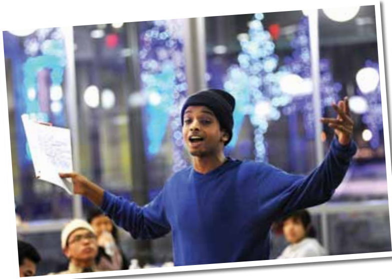
Nexus Youth Services partnered with the Mississauga Arts Council to launch the Youth Writers' Guild. The launch, "I Have Roots," was a spoken-word performance and coffee house that celebrated Black History Month.

Peel Children's Centre and Nexus Youth Services remain passionately committed to being inclusive and culturally competent organizations, skilled in meeting the mental health treatment needs of our diverse community.