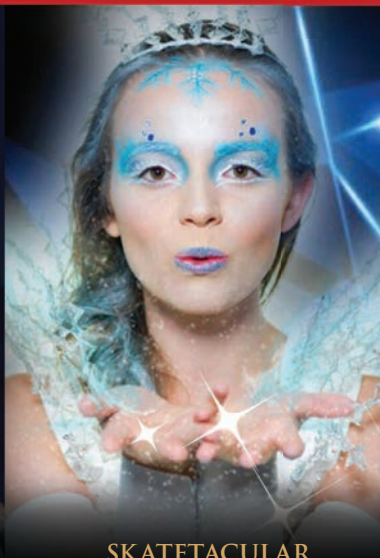
SKATETACULAR DREAMS ON ICE January 16, 2018