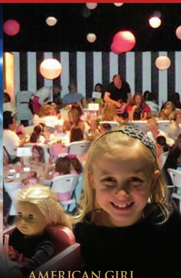
AMERICAN GIRL TEA EVENT November 18, 2017 May 19, 2018