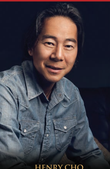
HENRY CHO, COMEDIAN January 6, 2018

Just call the box office at 859-583-1716 and we'll mail it out in time for any special occasion.