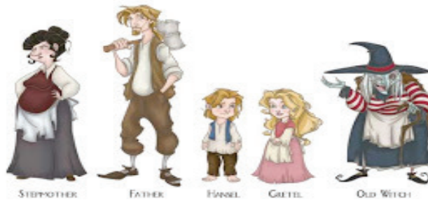
HANSEL & GRETEL CHARACTERS LINE-UP

Gordon Gumshoe Fairy Tale Detective incorporates stories usually attributed to the famous German storytelling duo known as the Brothers Grimm. Professors Wilhelm and Jacob Grimm did not create these stories; but they did record folklore from around the world that was passed down for generations. The Brothers Grimm compiled 86 local German legends and fairy tales into their first volume of Kinder-und Hausmärchen published in 1812. Ultimately, more stories were collected resulting in eight published editions of Kinder-und Hausmärchen containing 200 folktales and 10 children's legends.