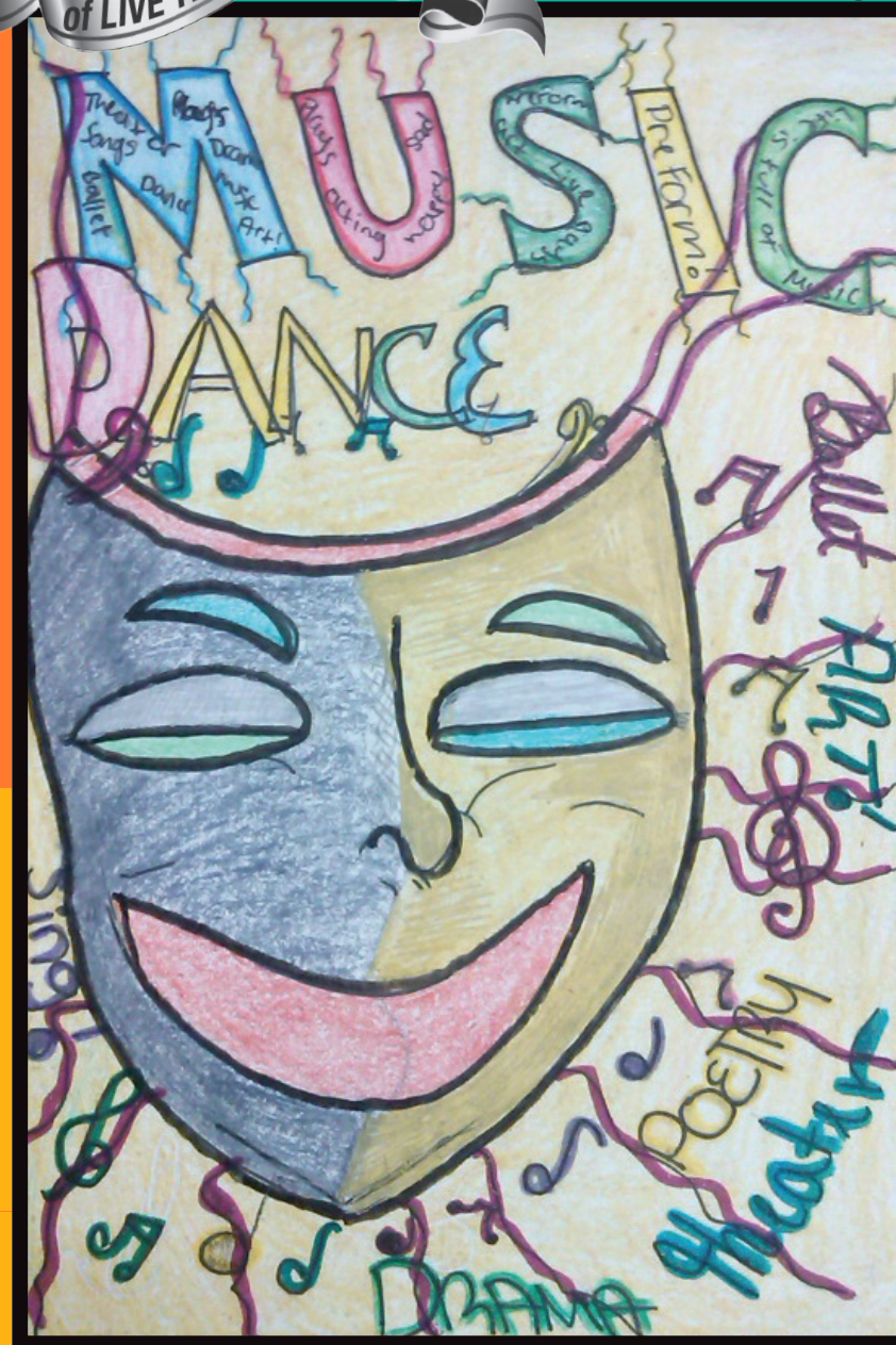
Cover Artist: Ciera Williams, Imperial Estates Elementary